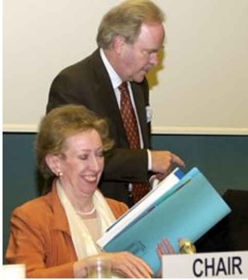
Margaret Beckett, UK