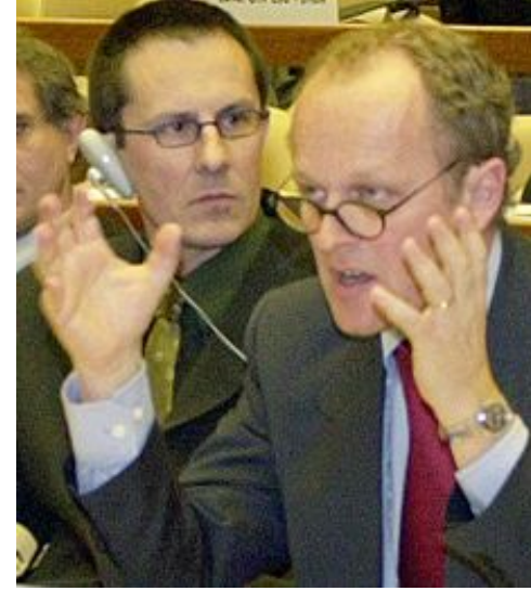
Beat Nobs, Switzerland

Switzerland called on the CSD to reach a common understanding on IWRM, and stated that cooperation and private involvement should be enhanced and that CSD-12 should focus on individual experiences and lessons learned. The EC expressed a need for good donor coordination. The US requested governments to formulate their needs in terms of capacity building in order for donor countries and institutions to better respond to them.