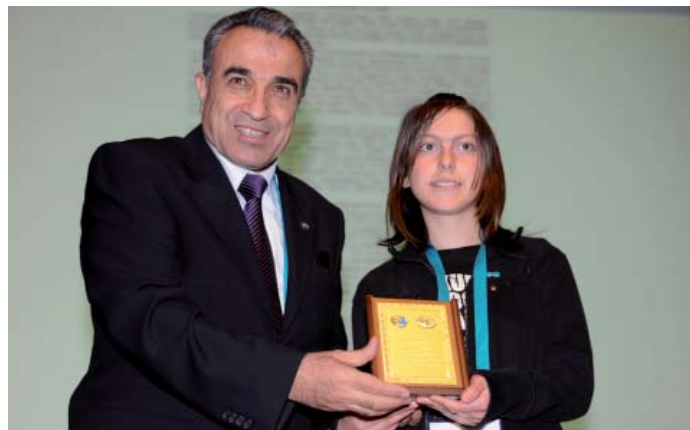
One of the winners showing her award during the Turkey Day Technical Session Awards and Reception

within the basin and the surrounding area has led to the melting of snow and subsequent rise in water levels in the basin. He said these will necessitate the construction of large water-storage facilities.