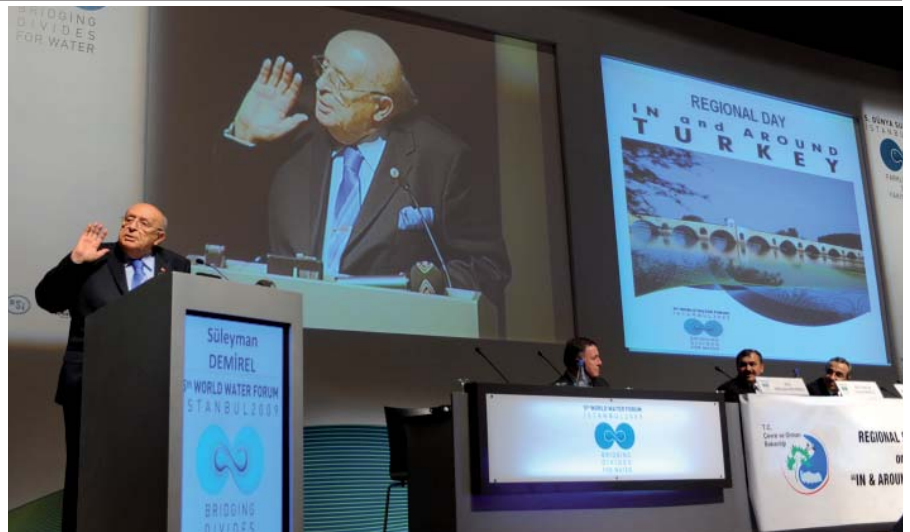
Süleyman Demirel, former President, Turkey, during his intervention in the afternoon

The 5th World Water Forum continued on Wednesday, 18 March in Istanbul, Turkey. Participants attended regional presentations on Africa and the sub-region “In and Around Turkey.” Parliamentarians met throughout the day to prepare their output as part of the political process. Participants also attended thematic sessions and side events, while the Water Fair and Expo continued at the Forum’s two venues.