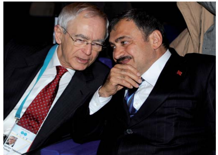
L-R: Oktay Tabasaran, Secretary General, World Water Forum, and Veysel Eroğlu, Minister of Environment and Forestry, Turkey

Süleyman Demirel, former President, Turkey, stressed that human beings have an obligation to protect the earth through better water management practices, emphasizing that “water is the centre of the universe.” Affirming that potable water is scarce, he noted that population growth could exacerbate the plight of millions of people without access to safe drinking water and proper sanitation. He highlighted the importance of dams for economic growth and social advancement.