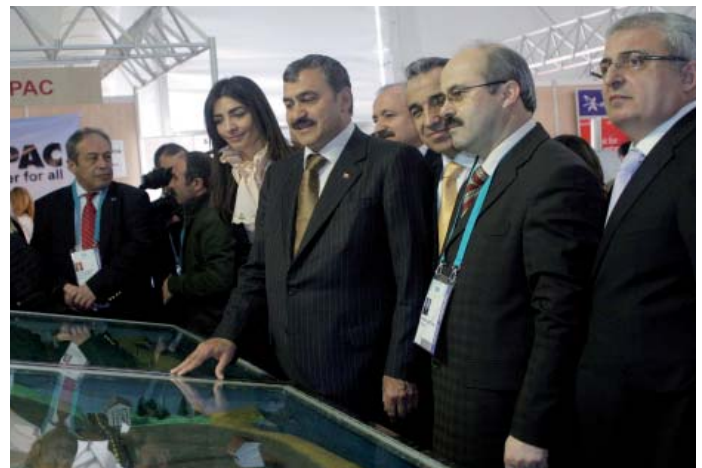
Veysel Eroğlu, Minister of Environment and Forestry, during the opening of the World Water Expo and Fair

WORLD WATER EXPO AND FAIR: Opened by Veysel Eroğlu, Minister of Environment and Forestry, the World Water Expo and Fair continued to display stands from international water and environment companies. Eroğlu highlighted that "the interest of so many companies highlights the importance of 5th World Water Forum and Turkey."