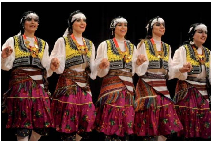
Local dancers entertained delegates throughout the day