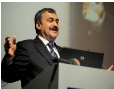
Veysel Eroğlu, Minister of Environment and Forestry, Turkey

Veysel Eroğlu then led a ministerial panel on climate change impacts in the region. He stressed the importance of legislation, early warning systems, adaptive strategies and cooperation. Raed Abu Saud, Minister of Water and Irrigation, Jordan, stressed the importance of cooperative mechanisms and legal