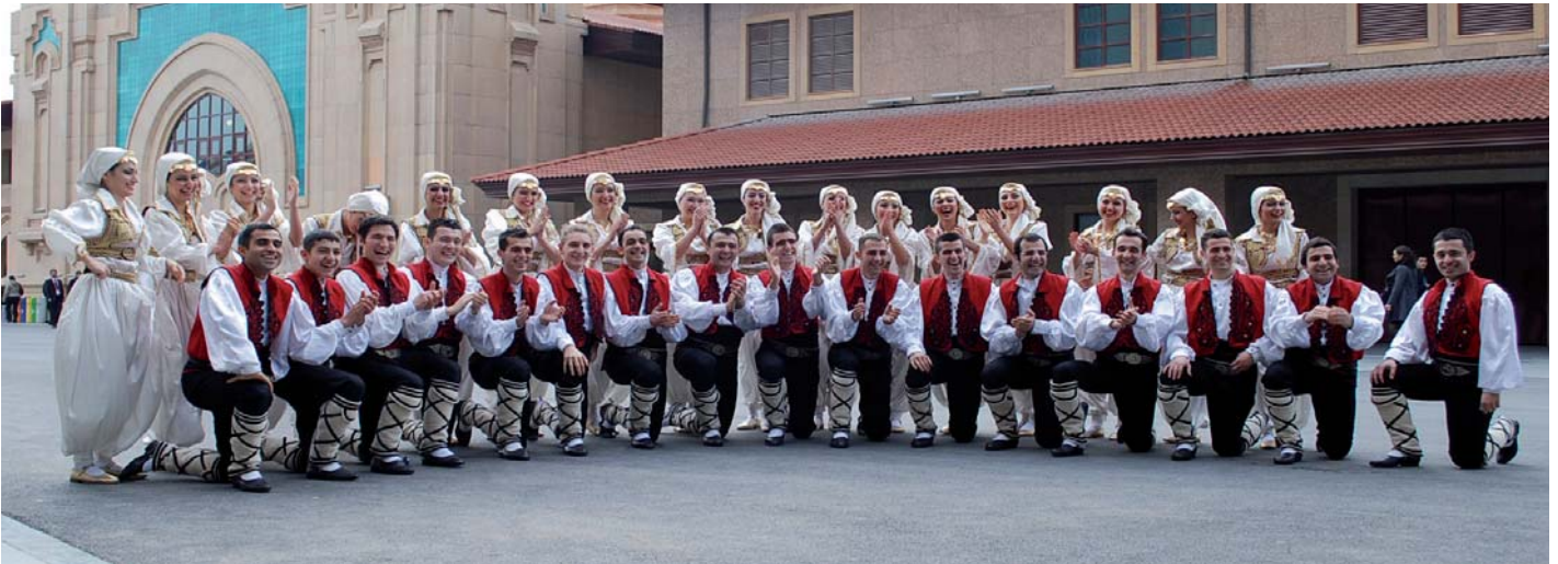
Local dancers posed for a photograph during the afternoon

to water and sanitation infrastructure. She listed violations of international humanitarian law by Israel as an occupying power and during the war.