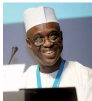
Bai-Mass Taal, Executive Secretary, AMCOW

AFRICA: Bai-Mass Taal, Executive Secretary, Africa Ministers' Council on Water (AMCOW), said the meeting would serve as a launching pad for the Africa Regional Paper and aimed to mobilize broad regional and international support to consolidate existing commitments to bridge water and sanitation divides in Africa. Asfow Dingamo, Minister of Water Resources, Ethiopia, noted that the World Water Forum offers an opportunity to announce Africa's successes, "not just doom and gloom."