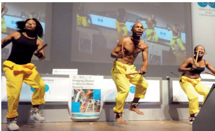
South African dancers performed during the Africa Regional Day

Mandla Gantsho, Vice President, African Development Bank (AfDB), presented the Africa Regional Paper: "Bridging Divides in Africa's Water Security: An Agenda to Implement Existing Political Commitments." He underscored that the report is the culmination of a comprehensive consultative process and complements the Africa Water Vision 2025. Gantsho welcomed the increase in water funding in recent years, but stressed the scale of the problem, which includes: expanding the percentage of irrigated arable land; delivering improved sanitation to 60% of Africa's population; and tackling capacity gaps.