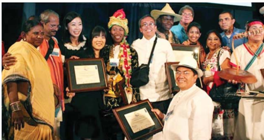
Photo of the winners of the Equator Prize 2010