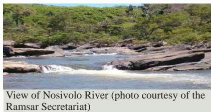
View of Nosivolo River

The Ramsar Secretariat has reported that Madagascar has designated its