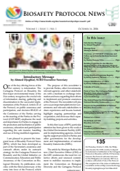
Front Page of Biosafety Protocol News