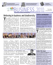
Front Page of Business.2010

modified organisms, and information on the work of the GEF and its implementing agencies ( http://www.biodiv.org/doc/newsletters/bpn/bpn-issue01.pdf ). Business.2010 is an informal platform primarily dedicated to helping the "business and biodiversity" community better prepare for CBD meetings. The first issue looks back at CBD COP-8 and includes articles as well as a list of COP-8 events, papers and statements, publications and upcoming meetings ( http://www.biodiv.org/doc/newsletters/news-biz-2006-10-low-en.pdf ).