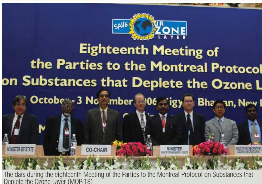
The dais during the eighteenth Meeting of the Parties to the Montreal Protocol on Substances that Deplete the Ozone Layer (MOP-18)