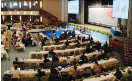
Delegates during the third session of the Ad Hoc Working Group on Further Commitments for Annex I Parties under the Kyoto Protocol (AWG)

The 26th sessions of the UN Framework Convention on Climate Change's (UNFCCC) Subsidiary Bodies (SB-26) are taking place from 7-18 May 2007 in Bonn, Germany, with delegates negotiating draft decisions that will be on the agenda at the next UNFCCC Conference of Parties and Kyoto Protocol Meeting of Parties in Bali, Indonesia, in December. In addition, the third session of the Ad Hoc Working Group on Further Commitments for Annex I Parties under the Kyoto Protocol (AWG) will run from 14-18 May. Also, the third workshop under the UNFCCC "Dialogue on long-term cooperative action to address climate change by enhancing implementation of the Convention" (UNFCCC Dialogue) is scheduled for 16-17 May. A workshop on the Russian Federation proposal relating to voluntary commitments under the Kyoto Protocol has also been held, along with numerous workshops and other events on issues ranging from the IPCC's Fourth Assessment Report to climate change mitigation and adaptation (http://www.iisd.ca/climate/sb26/).