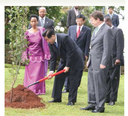
L-R: Anna Tibaijuka, Executive Director of UN-HABITAT; Jia Qinglin, Chairman of the Chinese National Committee of the People's Political Consultative Conference (CPPCC); and Achim Steiner, UNEP Executive Director, help plant a Pyrus pyrifolia tree

The UNEP's Billion Tree Campaign, which seeks to plant at least one billion trees worldwide during 2007, has recorded pledges of 962,060,125 trees as of 14 May 2007, with 13,635,782 trees already having been planted (http://www.unep.org/billiontreecampaign/). On 8 May 2007, staff of the World Agroforestry Centre in Nairobi, Kenya, made a contribution to the campaign by planting 2,500 seedlings in the Karura forest. In addition, during a visit to Nairobi on 26 April 2007, Jia Qinglin, Chairman of the National Committee of the Chinese People's Political Consultative Conference, announced China's pledge to plant 1,5 million trees this year (http://www.unep.org/billiontreecampaign/CampaignNews/index.asp).