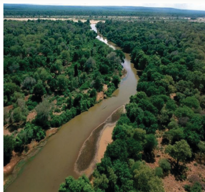
Makuleke Wetland