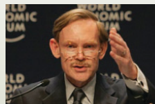
Robert Zoellick