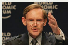
Robert Zoellick