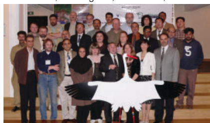
Participants at the Meeting for the MoU concerning Conservation Measures for the Siberian Crane

The sixth Meeting of the Signatories to the Memorandum of Understanding (MoU) concerning Conservation Measures for the Siberian Crane, an instrument developed under the Convention on Migratory Species (CMS), was held from 15-19 May 2007, in Almaty, Kazakhstan. The meeting brought together 50 participants from across the region, including officials from all eleven Range States (Afghanistan, Azerbaijan, China, India, Iran, Kazakhstan, Mongolia, Pakistan, Russian