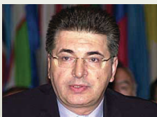
Srgjan Kerim