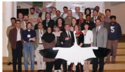
Participants at the Meeting for the MoU concerning Conservation Measures for the Siberian Crane

The sixth Meeting of the Signatories to the Memorandum of Understanding (MoU) concerning Conservation Measures for the Siberian Crane, an instrument developed under the Convention on Migratory Species (CMS), was held from 15-19 May 2007, in Almaty, Kazakhstan. The meeting brought together 50 participants from across the region, including officials from all eleven Range States (Afghanistan, Azerbaijan, China, India, Iran, Kazakhstan, Mongolia, Pakistan, Russian