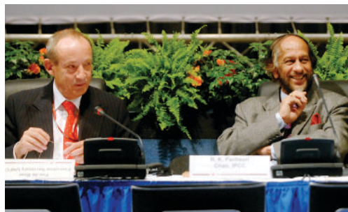
On Saturday, 12 May 2007, an IPCC briefing took place outlining the contributions of the three Working Groups to the Fourth Assessment Report (AR4). L-R: Executive Secretary Yvo de Boer and IPCC Chair Rajendra K. Pachauri

Delegates to the twenty-sixth sessions of the Subsidiary Bodies of the UN Framework Convention on Climate Change (UNFCCC), which convened in Bonn, Germany, from 7-18 May 2007, have adopted 27 conclusions and six draft decisions to forward to the climate change meetings to take place in December 2007 in Bali, Indonesia. Also taking place in Bonn were the third session of the Ad Hoc Working Group on Further Commitments for Annex I Parties under the Kyoto Protocol (AWG) and the third workshop under the Dialogue on long-term cooperative action to address climate change by enhancing implementation of the Convention. In addition, a workshop on the Russian Federation's proposal relating to voluntary commitments under the Kyoto Protocol was held, along with numerous workshops and other events on issues ranging from the IPCC's Fourth Assessment Report on climate change mitigation and adaptation ( http://www.iisd.ca/climate/sb26/ ). Commenting at the end of the meeting, UNFCCC Executive Secretary Yvo de Boer said: "This meeting has served to resolve a number of issues ahead of the Bali conference. We have come closer to broadening negotiations on a post-2012 regime by resolving some of the outstanding issues and clarifying which building blocks of a future agreement need to be put in place" ( http://unfccc.int/files/press/news_room/press_releases_and_advisories/application/pdf/20070518_final_sb26_english.pdf ).