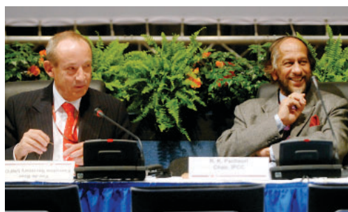
On Saturday, 12 May 2007, an IPCC briefing took place outlining the contributions of the three Working Groups to the Fourth Assessment Report (AR4). L-R: Executive Secretary Yvo de Boer and IPCC Chair Rajendra K. Pachauri

Delegates to the twenty-sixth sessions of the Subsidiary Bodies of the UN Framework Convention on Climate Change (UNFCCC), which convened in Bonn, Germany, from 7-18 May 2007, have adopted 27 conclusions and six draft decisions to forward to the climate change meetings to take place in December 2007 in Bali, Indonesia. Also taking place in Bonn were the third session of the Ad Hoc Working Group on Further Commitments for Annex I Parties under the Kyoto Protocol (AWG) and the third workshop under the Dialogue on long-term cooperative action to address climate change by enhancing implementation of the Convention. In addition, a workshop on the Russian Federation's proposal relating to voluntary commitments under the Kyoto Protocol was held, along with numerous workshops and other events on issues ranging from the IPCC's Fourth Assessment Report on climate change mitigation and adaptation ( http://www.iisd.ca/climate/sb26/ ). Commenting at the end of the meeting, UNFCCC Executive Secretary Yvo de Boer said: "This meeting has served to resolve a number of issues ahead of the Bali conference. We have come closer to broadening negotiations on a post-2012 regime by resolving some of the outstanding issues and clarifying which building blocks of a future agreement need to be put in place" ( http://unfccc.int/files/press/news_room/press_releases_and_advisories/application/pdf/20070518_final_sb26_english.pdf ).