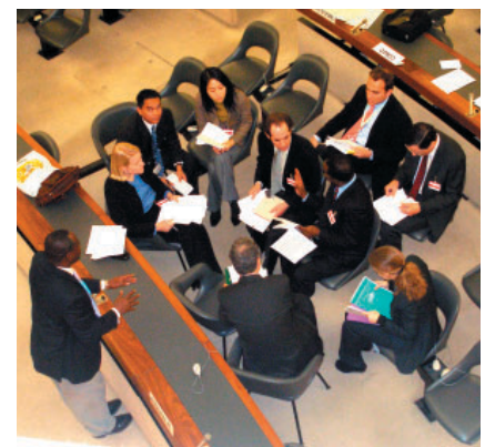
Delegates during ITTA-4 informal consultations

The International Tropical Timber Agreement, 2006, is set to open for signature at UN headquarters in New York beginning 3 April 2006, and extending until one month after the date of its entry into force. The agreement, which was concluded in January 2006 as the successor agreement to ITTA, 1994, is expected to come into force in 2008 and will operate for ten years, with the possibility of extensions of up to eight years. http://www.itto.or.jp/live/PageDisplayHandler?pagelid=217&id=1126