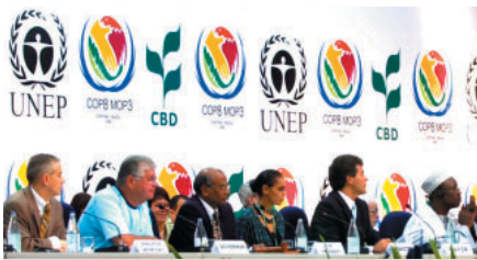
Dais at the opening of CBD COP-8

The eighth Conference of the Parties to the Convention on Biological Diversity (CBD COP-8) is being held from 20–30 March 2006, in Curitiba, Brazil ( http://www.iisd.ca/biodiv/cop8/ ). The agenda of the meeting includes: adoption of a work programme on island biodiversity; access and benefit-sharing (ABS), including setting up a process for continuing negotiations on an international regime; protected areas; cooperation with other conventions and