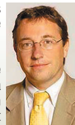
Achim Steiner