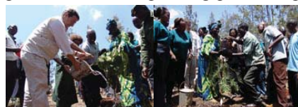
UNEP Executive Director, Achim Steiner, and Nobel Laureate, Wangari Maathai participated in the tree-planting

In other UNEP news, in March 2008, 3000 indigenous tree seedlings were planted in the Karura forest, Kenya, marking the beginning of UNEP’s Private Sector tree-planting initiative under the Nairobi River Basin Programme. The tree planting partnership