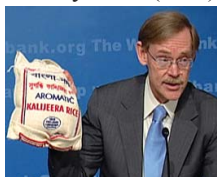
World Bank President Robert B. Zoellick.

The annual World Bank Group (WBG) and International Monetary Fund (IMF) Spring Meetings took place on 12-13 April 2008, in Washington DC, US. At the joint Development Committee, countries reviewed progress toward the Millennium Development Goals, as reflected in the fifth Global Monitoring Report, and urged donors to increase their support for the poorest countries' own development priorities. They highlighted the issue of rising food and energy prices and their impact in developing countries and welcomed the call by the World Bank President to combat hunger and malnutrition through a "New Deal for Global Food Policy," combining immediate assistance with medium and long-term efforts to boost agricultural productivity in developing countries. Regarding the Concept and Issues Note on the Strategic Framework on Climate Change and Development for the WBG (SFCCD), they asked for the SFCCD to elaborate further on the additional financing needs for addressing climate change, the mobilization of private sector funding and the complementarities between existing and new financing mechanisms, as well as the proposed role of the WBG under a division of labor vis-à-vis the UN, and other key international players, including