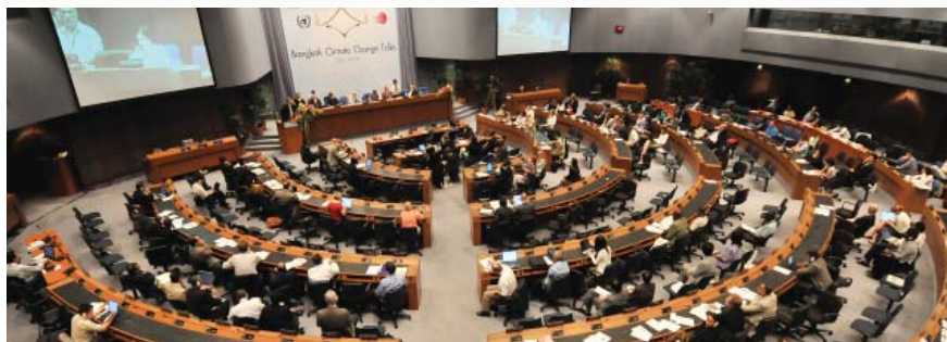
Bird's eye view of the plenary room of the Bangkok Climate Change Talks