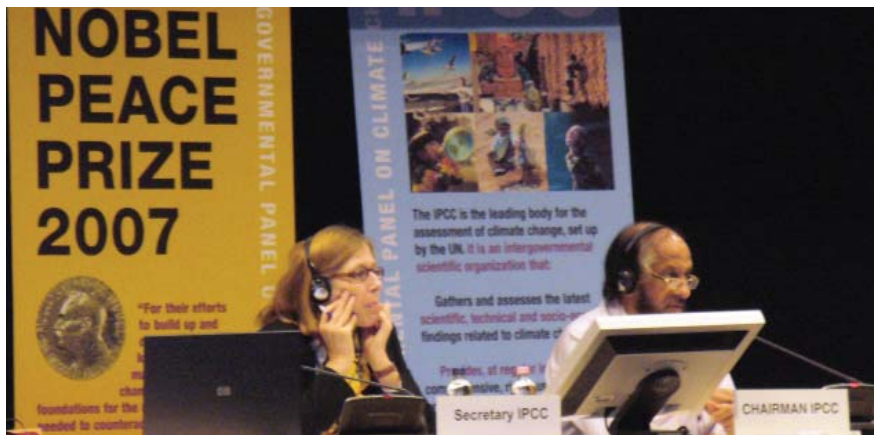
L-R: Renate Christ, IPCC Secretary, and IPCC Chair Rajendra Pachauri at IPCC 28

The 28th session of the Intergovernmental Panel on Climate Change (IPCC), which met from 9-10 April 2008, in Budapest, Hungary, discussed the future of the IPCC, including key aspects of its work programme such as Working Group structure, main type and timing of future reports, and the future structure of the IPCC Bureau and the Bureau of the Task Force on National Greenhouse Gas Inventories (TFB). The IPCC plenary agreed to prepare a Fifth Assessment Report (AR5) and to retain the current structure of its Working Groups. To enable significant use of new scenarios in the AR5, the Panel requested the Bureau of the Fifth Assessment cycle to ensure delivery of the Working Group I report by early 2013 and complete the other Working Group reports and the Synthesis Report at the earliest feasible date in 2014. The Panel also agreed to the preparation of a Special Report on Renewable Energy to be completed by 2010 and was presented with the Technical Paper on Climate Change and Water. It deferred discussion on the use of its Nobel Peace Prize funds until IPCC 29 (1-4 September 2008, Geneva, Switzerland) ( http://www.iisd.ca/climate/ipcc28/ ).