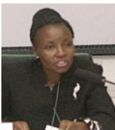
UN Deputy Secretary-General Asha-Rose Migiro

Within the framework of the UN General Assembly consultations on UN System-wide Coherence, member States met on 28 March 2008, at UN headquarters in New York, US, to consider the issue of Delivering as One at Country Level, and on 7 April 2008, to discuss the UN funding structure. On 28 March, UN Deputy Secretary-General Asha-Rose Migiro noted that significant progress had been achieved on the “One budgetary framework,” as well as on increased accountability and national ownership, while cautioning that new priorities must be set for 2008, including closing the funding gap. Several members of the Non-Aligned Movement and the Group of 77 also drew attention to the funding gap, underlining that savings must be channeled back into the system. Discussions on funding on 7 April focused on achieving a better balance between non-core and core funding, resource mobilization and reviewing funding mechanisms ( http://www.centerforunreform.org/node/324 ; http://www.un.org/ga/president/62/issues/resolutions/Consultations200308.pdf ; http://www.un.org/ga/president/62/issues/resolutions/letteronFunding4408.pdf ).