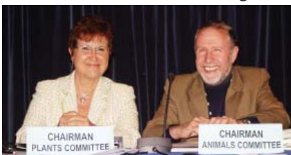
The Chairs-elect of the CITES Plants and Animals Committees – Margarita Clemente Muñoz and Thomas Althaus

The 17th meeting of the Plants Committee of the Convention on International Trade in Endangered Species of Wild Fauna and Flora (CITES) is convening from 15-19 April 2008, in Geneva, Switzerland, and will be followed by the 23rd meeting of the Animals Committee, which will meet from 19-24 April. On 19 April, the two Committees will hold a joint meeting. Approximately 300 delegates are expected to attend, as the Committees take up the programme of work established at the 14th Conference of the Parties held in The Hague, the Netherlands, in June 2007. The Plants Committee's agenda includes CITES-listed timber species such as the bigleaf mahogany, South American cedar and rosewood. This Committee is likely to focus on the effects of international trade on timber species. It will hear details of a joint CITES-International Tropical Timber Organization project aimed at ensuring that international trade in CITES-listed timber species is consistent with their sustainable management