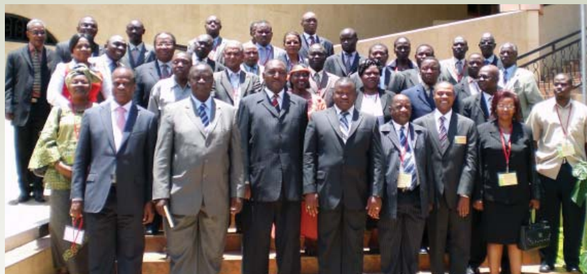
Participants at the end of the meeting

To combat these and other related problems, the Lusaka Agreement established a permanent Lusaka Agreement Task Force in 1999. This unique Task Force is composed of national law enforcement officers seconded by the parties. Additionally, National Bureaus conduct joint cross-border law enforcement operations and conduct training and inter-agency awareness programmes both independently and with the Task Force. The work of the Task Force has been instrumental in addressing wildlife crime, as evidenced by its role in the seizure of