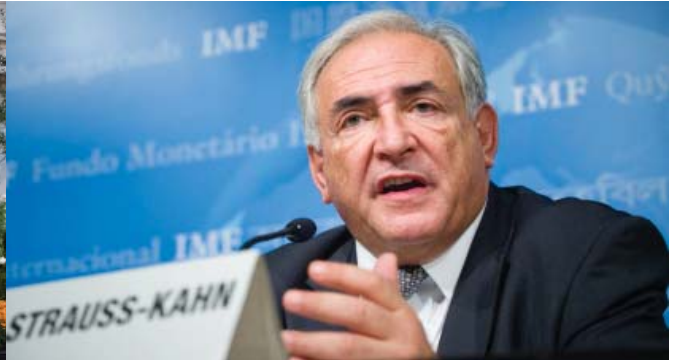
Photos of the Annual meetings of the Boards of Governors of the International Monetary Fund and World Bank