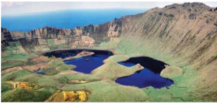
Caldeirão do Corvo