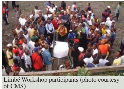
Limbé Workshop participants

A CBD capacity-building workshop for Central Africa on National Biodiversity Strategies and Action Plans (NBSAPs) and mainstreaming of biodiversity, held from 22-25 September 2008, in Limbé, Cameroon, brought together focal points of CBD, CMS, the Commission for the Forests of Central Africa and the Great Apes Survival Project (GRASP) to discuss issues related to NBSAPs, including the integration of migratory species, particularly gorillas, into NBSAPs. CMS and GRASP delegates also addressed the Gorilla Action Plan, which is due to be passed as a resolution at the first Meeting of the Parties to the Gorilla Agreement, to be held on 29 November 2008, in Rome, Italy ( http://www.cms.int/news/PRESS/nwPR2008/10_Oct/nw0810_CMS_CBD_Limbe.htm ).