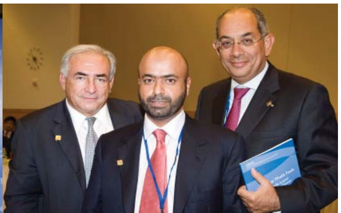
Photos of the Annual meetings of the Boards of Governors of the International Monetary Fund and World Bank