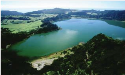
Complexo Vulcânico das Furnas