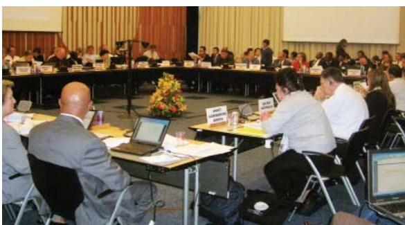
Throughout the week, the Committee continued progress with its agenda, completing deliberations on c-octaBDE, PeCB, alpha-HCH and beta-HCH

The fourth meeting of the Persistent Organic Pollutants Review Committee (POPRC4) of the Stockholm Convention on Persistent Organic Pollutants (POPs), which convened from 13-17 October 2008, in Geneva, Switzerland, considered several operational issues, including conflict-of-interest procedures, toxic interactions