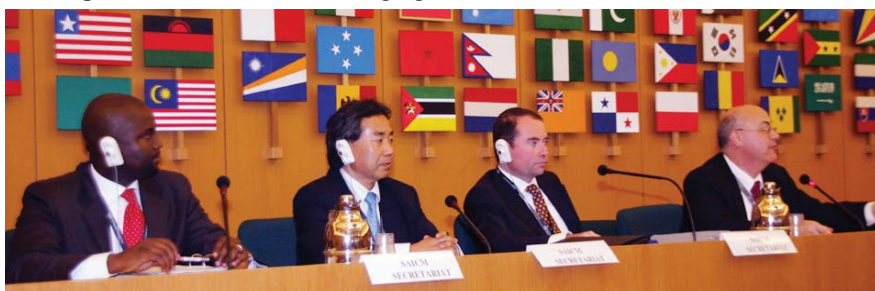
Members of the SAICM Secretariat during the opening plenary of the Open-ended Legal and Technical Working Group in preparation for the Second ICCM

The Second Meeting of the Ad hoc Open-ended Working Group (OEWG2) to Review and Assess Measures to Address the Global Issue of Mercury met from 6-10 October 2008, in Nairobi, Kenya. The OEWG discussions included: elements to be addressed by a mercury framework; actions to be undertaken to address mercury; and the capacity building, financial and technical support required to deliver on the actions. Delegates recommended that the UN Environment Programme Governing Council adopt a policy framework on mercury and narrowed down the list of implementation instruments – one legally-binding and three voluntary options – for its consideration in February 2009 ( http://www.iisd.ca/chemical/merc2/ ).