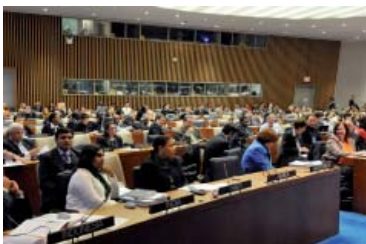
Delegates during a CSD17 IPM plenary

The Intergovernmental Preparatory Meeting (IPM) for the 17th session of the Commission on Sustainable Development (CSD17) took place from 23-27 February 2009, at UN Headquarters in New York, US. The IPM's role was to provide a forum to discuss policy options and possible actions to enable the implementation of measures and policies concerning agriculture, rural development, land, drought, desertification and Africa – the thematic issues under consideration