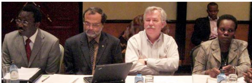
Participants during the HCFC Phase-out Management Plans seminar