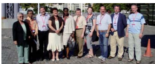
Members of the Plants Committee

The 18th meeting of the Plants Committee of the Convention on International Trade in Endangered Species of Wild Fauna and Flora (CITES) convened from 17-21 March 2009, in Buenos Aires, Argentina. The meeting addressed proposals for amendments to the Ap-