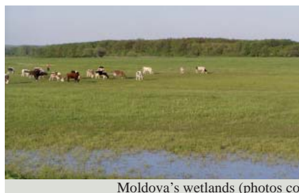
Moldova's wetlands

The Ramsar Secretariat has reported that the Center for Strategic Environmental Studies ECOS in the Republic of Moldova has carried out a small grants fund (SGF) project addressing a baseline inventory of priority wetlands in the Moldovan part of the Danube river basin, which should be a part of the Danube River Basin Management Plan to achieve integrated management of water resources in line with the EU Water Framework Directive. With the project, Moldova made a first inventory of all inland and human-made wetlands in the Moldovan part of the Danube river basin ( http://www.ramsar.org/sgf/sgf_rpts_moldova_inventory.htm ).