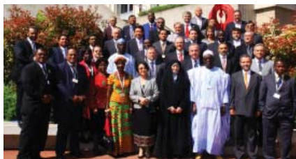
Group photo of Ministers attending the POPs COP4 High-Level Segment