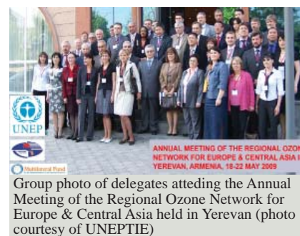
Group photo of delegates attending the Annual Meeting of the Regional Ozone Network for Europe & Central Asia held in Yerevan

agreed to enhance this new cooperation by creating a joint website. It was also recommended to include a provision in phase-out management plans for HCFCs for capacity building and networking of national RAC associations ( http://www.uneptie.org/ozonAction/archive_features.htm ).