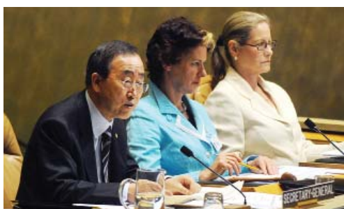
UN Secretary-General Ban Ki-moon addressed the High-level Segment. He highlighted that sustainable agriculture can contribute to climate change mitigation and urged CSD17 to inspire the world to address the multiple daunting challenges faced.

Delegates to the 17th session of the UN Commission on Sustainable Development (CSD17), which convened from 4-15 May 2009, at UN Headquarters in New York, US, focused on the thematic cluster of agriculture, rural development, land, drought, desertification and Africa. CSD17 negotiated policy recommendations based on CSD16's review of the issues and the development of a draft Chair's Negotiating Text during an Intergovernmental Preparatory Meeting, which convened in February 2009. Delegates