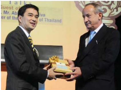
Thai Prime Minister Abhisit Vejjajiva presents Yvo de Boer, UNFCCC Executive Secretary with a gift