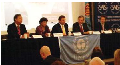
The dais during the launch of “Global Market Transformation for Efficient Lighting Platform”

In other IDB news, the Bank has released a new version of its Biofuels Sustainability Scorecard, which will enable users to better anticipate the impacts of potential biofuel projects on sensitive issues such as indigenous rights, carbon emissions from land use change, and food security ( http://www.iadb.org/biofuelsscorecard/ ).