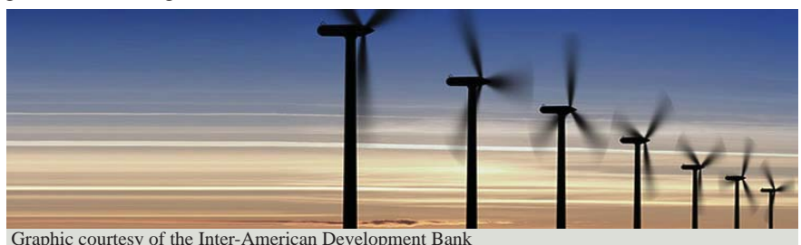
Graphic courtesy of the Inter-American Development Bank