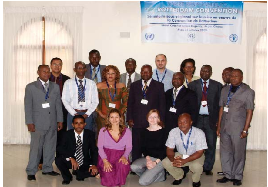
Participants during the Accra workshop

The Secretariat of the Rotterdam Convention convened sub-regional training and awareness-raising workshops for francophone African Designated National Authorities (DNAs) on the implementation of the Rotterdam Convention in Accra, Ghana, from 19-23 October 2009. The objectives of the workshop were to: strengthen the capacity of DNAs through the provision of practical training on the key obligations and operational elements of the Convention; facilitate a national dialogue among relevant stakeholders on the implementation of the Rotterdam Convention; and raise awareness of the linkages between the Basel, Stockholm and Rotterdam Conventions ( http://www.pic.int/home.php?type=s&id=77 ).