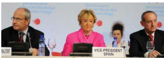
L-R: José Montilla Aguilera, President of the Generalitat de Catalunya; Maria Teresa Fernández de la Vega, Vice-President of Spain; and Yvo de Boer, UNFCCC Executive Secretary

The resumed ninth session of the Ad Hoc Working Group on Further Commitments for Annex I Parties under the Kyoto Protocol (AWG-KP 9) and resumed seventh session of the Ad Hoc Working Group on Long-term Cooperative Action under the Convention (AWG-LCA 7) were held from 2-6 November