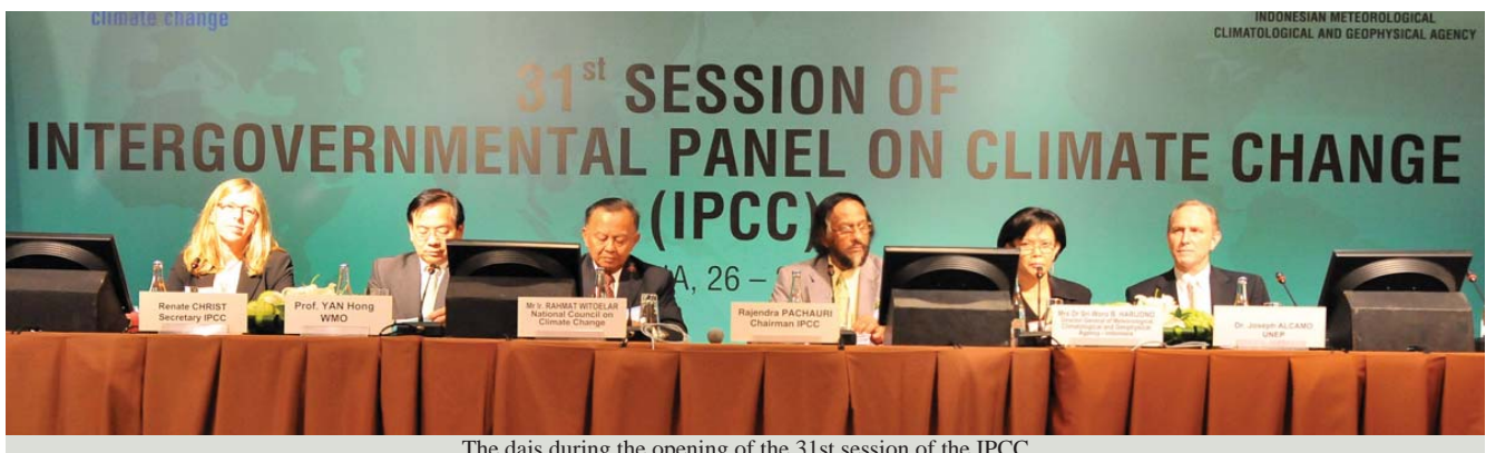
The dais during the opening of the 31st session of the IPCC

the IPCC Peace Prize Scholarship Fund ( http://www.iisd.ca/climate/ipcc31/ ; http://www.ipcc.ch/meeting_documentation/meeting_documentation_31th_session.htm ). In other IPCC news, experts gathered in Panama City, Panama, on 9 November 2009, to begin work on a Special Report entitled "Managing the Risk of Extreme Events and Disasters to Advance Climate Change Adaptation." The report will assess how climate change will affect disaster risks in the future and how countries can better manage the expected increases in damaging weather events due to climate change ( http://www.unisdr.org/news/v.php?id=11682 ).