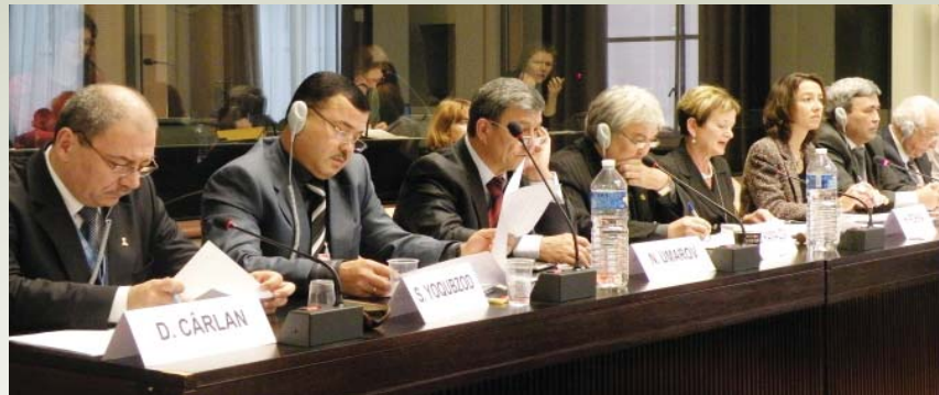
The dais during the Meeting of the Parties to the UNECE Convention on the Protection and Use of Transboundary Watercourses and International Lakes (Water Convention)

Another unique instrument adopted by the Meeting is the Guidance on Water and Adaptation to Climate Change , which gives advice to countries on how to cope with the uncertainties of climate change together and to effectively tackle its impacts in a concerted way. The Guidance is considered to be an important contribution to the upcoming COP 15 of the United Nations Framework Convention on Climate Change, and will be launched during a COP 15 unofficial side event in the Dutch Pavilion.