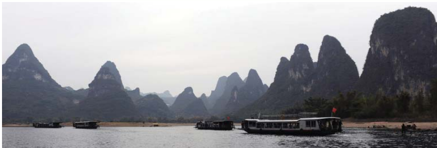
A view of the beautiful scenery along the Lijiang river