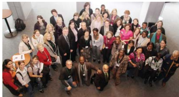
The newly formed "Like-Minded in Spirit Group of Women."

The eighth meeting of the Ad Hoc Open-ended Working Group on Access and Benefit-sharing (ABS 8) of the Convention on Biological Diversity (CBD) was held from 9-15 November 2009, in Montreal, Canada. The Working Group on ABS continued the negotiation of an international regime