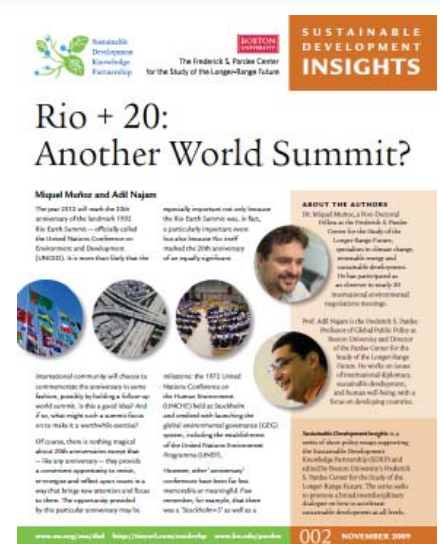
Image: Cover of "Rio + 20: Another World Summit?