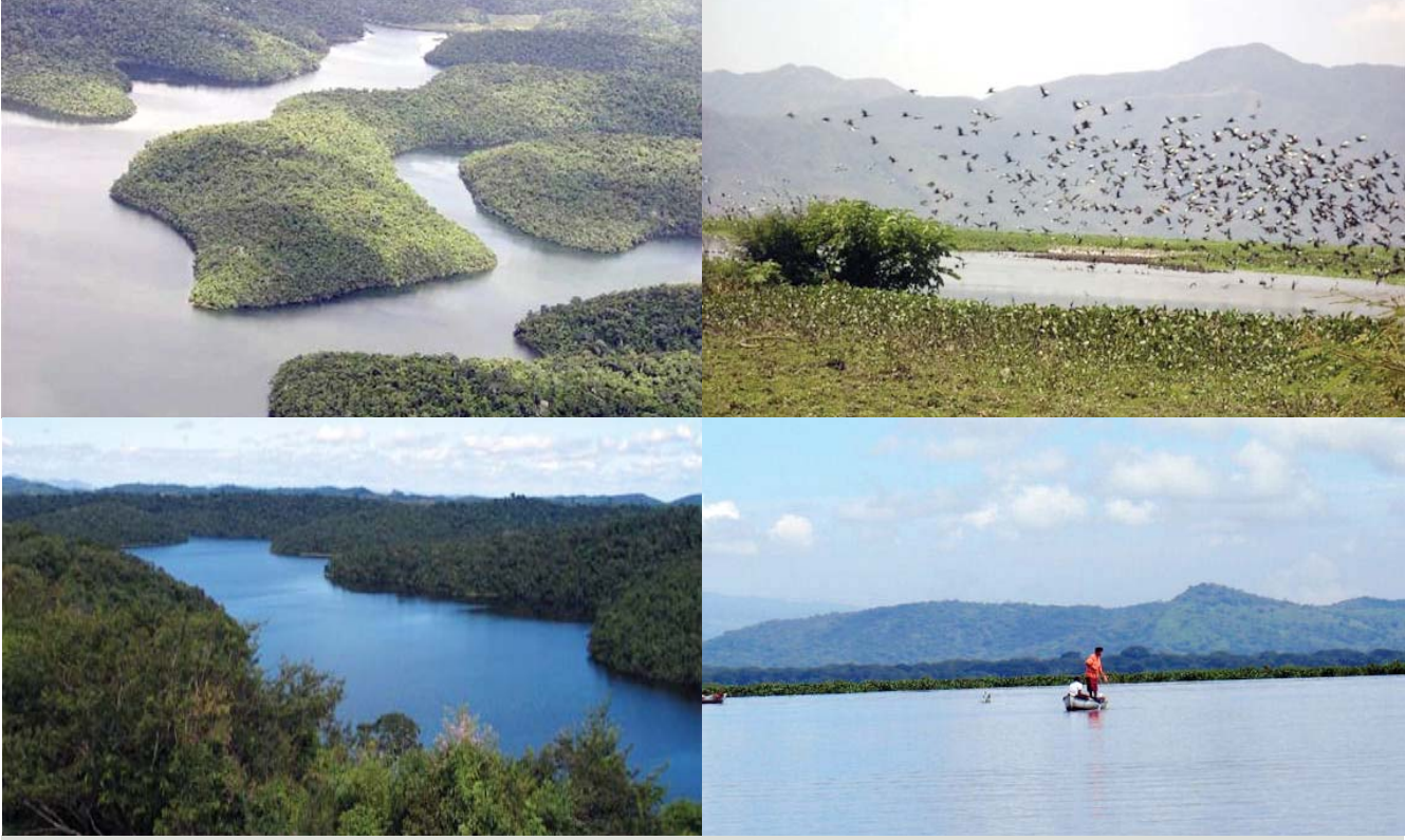
Parque Estadual do Rio Doce (left) and Laguna de Olomega (right)

currently working with UNEP/GRID-Arendal on a rapid assessment report on waste water, to be published on 22 March 2010, World Water Day. The Office is also preparing for an event to be held from 22-24 March 2010, in Nairobi, Kenya (IISD RS Sources).