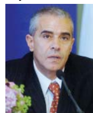
Ahmed Djoghlaif, CBD Executive Secretary

Ahmed Djoghlaif, Executive Secretary of the Convention on Biological Diversity (CBD) addressed the “Green Economy” roundtable held at the 11th Special Session of the UN Environment Programme (UNEP) Governing Council/Global Ministerial Forum, as well as the UNEP workshop on journalism and the environment. He underscored that a green economy requires the sustainable use of natural resources and, therefore, the full implementation of the three CBD objectives. He also drew attention to the outputs of the third CBD meeting on business and biodiversity held from 30 November-2 December 2009, in Jakarta, Indonesia, namely the Jakarta Charter on Business and Biodiversity, and comments for a strategy to advance the 2020 business and biodiversity agenda. In the workshop on journalism and the environment, he stressed that one of the reasons for the failure to reach the 2010 biodiversity target is that the value of biodiversity