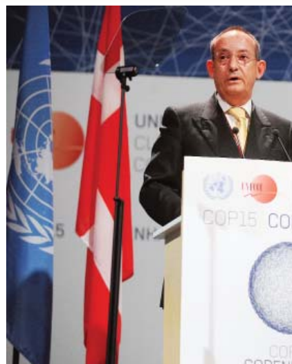
Yvo de Boer, UNFCCC Executive Secretary