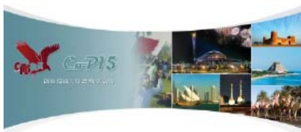
Logo courtesy of the CITES Secretariat