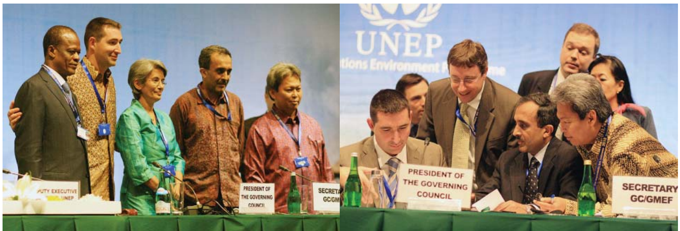
The dais during GCSS-11/GMEF

The Sasakawa Prize, which aims to incentivize sustainable and replicable grassroots environmental efforts, was awarded during a side event at the GCSS-11/GMEF. Two grassroots climate-projects operating in Africa and South America were awarded the prestigious UNEP award ( http://unep.org/sasakawa/ ).