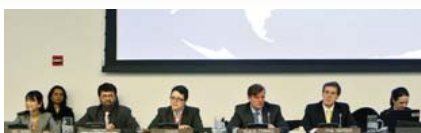
The dais during the CSD Thematic Seminar on Chemicals