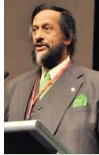
Rajendra Pachauri, IPCC Chair

The Intergovernmental Panel on Climate Change (IPCC) held an informal briefing during the 11th Special Session of the UN Environment Programme (UNEP) Governing Council/Global Ministerial Environment Forum. During the session, IPCC Chair Rajendra Pachauri highlighted the Panel's intention to establish an independent committee to review IPCC procedures. This informal briefing was followed up by an IPCC statement from Chair Pachauri, indicating that an independent committee of distinguished experts will be established to evaluate means by which IPCC procedures must be implemented fully and that they should also examine any changes in procedure that may be required. The mechanism by which such an independent review will take place is under active consideration. Details on the mechanism for setting up the proposed independent review will be shared in early March. The proposal to set up such an independent committee