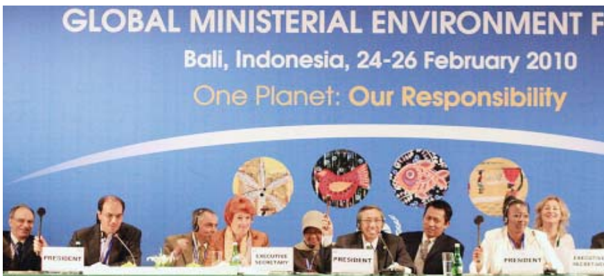
Presidents of the Basel, Rotterdam and Stockholm Conventions gavel a decision simultaneously

The Simultaneous Extraordinary meetings of the Conferences of the Parties to the Basel, Rotterdam and Stockholm Conventions (ExCOPs) convened under the theme “Greater Strength in Sync,” from 22-24 February in Bali, Indonesia. The meeting was the first time three independent treaty conferences convened simultaneously. The meeting took decisions on, inter alia , joint services, activities and managerial functions, and a review mechanism and follow up. Debate on joint managerial functions revolved around the potential of immediately appointing an interim joint Head of the three Secretariats. Delegates agreed to the appointment of a joint Head, and to review the position and its effectiveness.