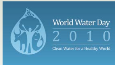
Banner courtesy of the World Water Day

The World Water Day website ( http://www.worldwaterday2010.info ) provides clear arguments and tools aimed at addressing different stakeholders, channeling efforts to reach policy makers and the public at large. The site has become a window to inform and communicate, highlighting the threats of water pollutants, the risk they pose to human health, and highlighting the economic return from improved sanitation. These are all important factors that need to be considered when policies and laws are drafted or, more simply, when human behavior poses a menace to our water resources.