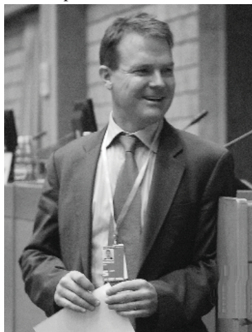
John Scanlon, CITES Secretary-General

range of sharks, corals, reptiles, insects and plants species. Other issues on the agenda include the adoption of urgent measures to tackle illegal trade of tiger products, rhinos and other species that are on the brink of extinction. The meeting will also address the potential impacts of CITES measures on the livelihoods of the rural poor, and those on the frontlines of using and managing wildlife ( http://www.cites.org/eng/news/press/2010/20100313_cop15.shtml ).