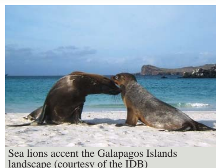
Sea lions accent the Galapagos Islands landscape

news, the IDB has approved a US$4 million Global Environment Facility (GEF) grant to support the country’s marine and coastal protected areas network and help implement a national plan for the protection of sharks ( http://www.iadb.org/NEWS/detail.cfm?Language=En&artType=PR&artid=6693&id=6693 ). A US$3 million GEF grant has also been approved to preserve marine and coastal ecosystems in Costa Rica ( http://www.iadb.org/NEWS/detail.cfm?Language=En&artType=PR&artid=6702&id=6702 ).