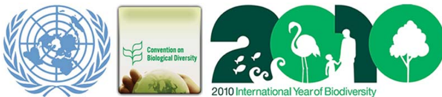
Logos courtesy of the UN