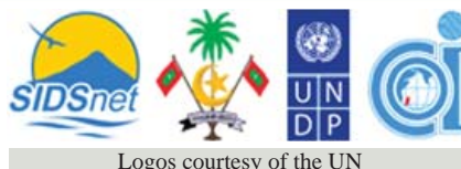
Logos courtesy of the UN