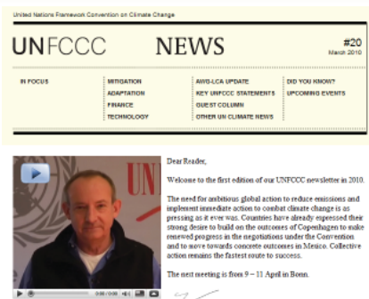
UNFCCC News - issue #20 cover

Notifications from the UNFCCC have been released regarding the upcoming 11th session of the Ad Hoc Working Group on Further for Annex I Parties under the Kyoto Protocol and the ninth session Ad Hoc Working Group on Long-