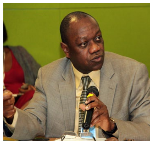
Sekou Toure, GEF, highlighted GEF's interest in improving national level reporting of the implementation of the Rio Conventions.

More information: http://www.riopavilion.org