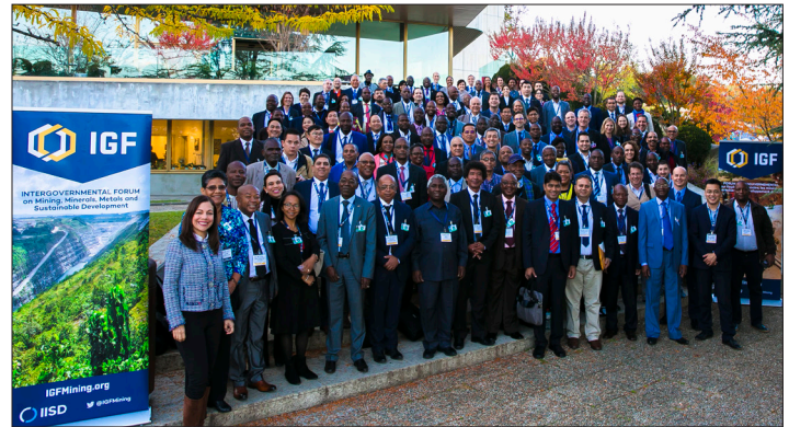
A group photo of the delegations at the IGF intergovernmental workshop

The IGF serves as a global venue for dialogue among 62 member country governments, as well as mining companies and industry associations. The IGF was created following the 2002 World Summit on Sustainable Development (WSSD), a global intergovernmental meeting that met in Johannesburg, South Africa, to assess progress since the 1992 UN Conference