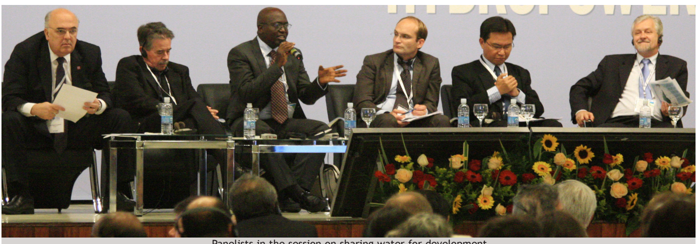
Panelists in the session on sharing water for development

Participants discussed, among other things, social benefits of multi-purpose hydropower projects and case-by-case versus standardized approaches for identifying project-affected communities. On the Protocol's expected impact on social issues, Locher recognized that as a scoring tool it reduces complex social issues to numbers, but underscored its main value will be to act as a bridge between different world views and to facilitate dialogue among stakeholders.