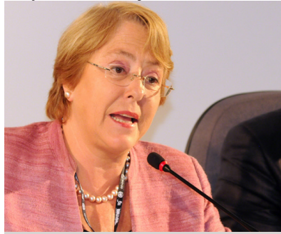
Michelle Bachelet, Executive Director of UN Women

to achieve zero net land degradation must recognize women's contribution to land stewardship and knowledge dissemination. He outlined ongoing initiatives to strengthen gender mainstreaming in national implementation programmes, including extending resources