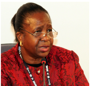
Alcinda Antonio de Abreu, Minister for the Coordination of Environment Affairs, Mozambique

Presenting case studies , Antonio de Abreu highlighted a recent sub-regional conference with Kenya and Tanzania that aimed to develop a common road map to a green economy and