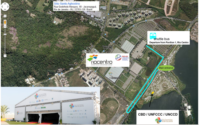
Map to Rio Conventions Pavillion in Athlete's Park

UNCCD: In 1992, the UN General Assembly, as requested by the UN Conference on Environment and Development (UNCED or Rio Earth Summit), adopted resolution 47/188 calling for the establishment of an Intergovernmental Negotiating Committee for the elaboration of a convention to combat desertification in those countries experiencing serious drought and/or desertification, particularly in Africa (INCD). The INCD met five times between May 1993 and June 1994 and drafted the UNCCD and four regional implementation annexes for Africa, Asia, Latin America and the Caribbean, and the Northern Mediterranean. A fifth annex, for Central and Eastern Europe, was adopted during the fourth Conference of the Parties (COP 4) in December 2000.