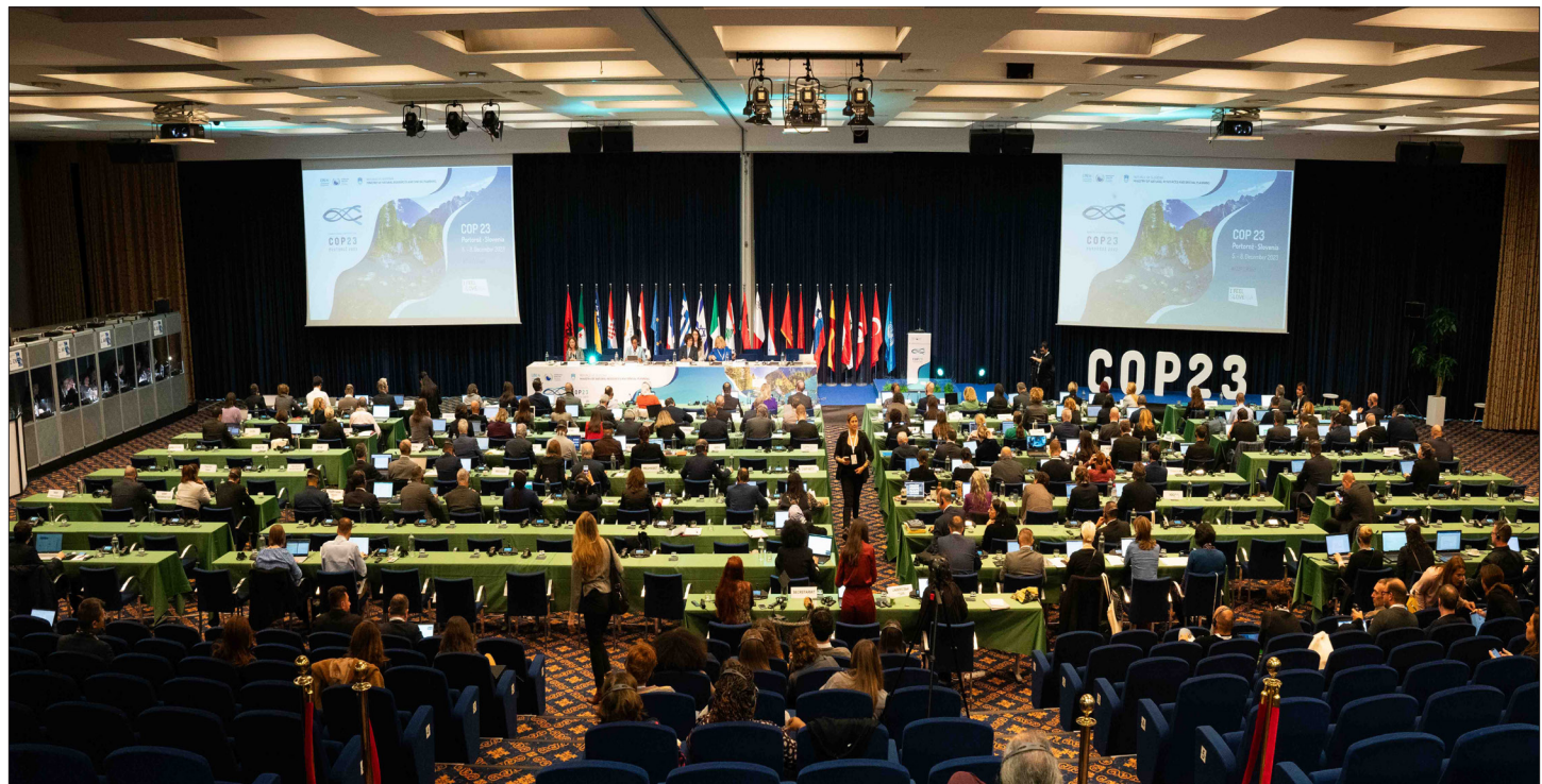
Delegates follow the COP 23 proceedings

EGYPT questioned whether corridors should be mentioned as the most important pathway of introduction for non-indigenous species, with the Secretariat clarifying that the data comes from the QSR. The PARLIAMENTARY ASSEMBLY OF THE MEDITERRANEAN drew attention to the hazards of persistent organic pollutants and called for a swift ban on their production and use, and the promotion of alternatives. The Secretariat underscored the EU proposal would be added, with the Information and Communication Regional Activity Centre of the Barcelona Convention (INFO/RAC) providing details online