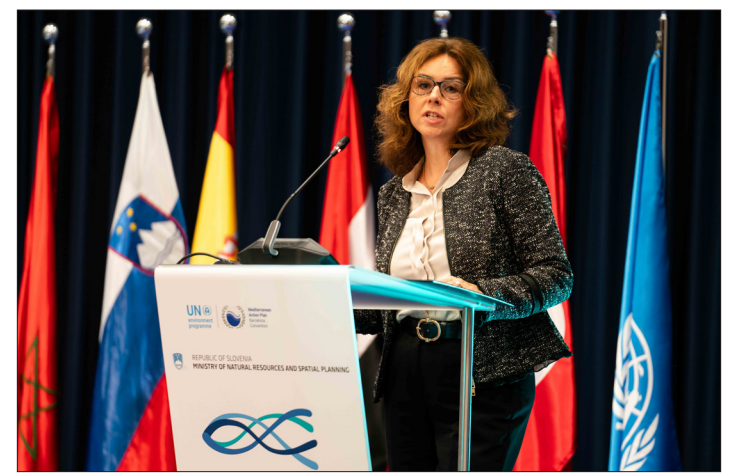
Maša Kociper, Slovenia's State Secretary at the Office of the Prime Minister

Delegates watched a video, from host country Slovenia, that showcased successful examples of integrated coastal and river basin management, carried out through regional cooperation. The video concluded "there is no green solution without blue wisdom."