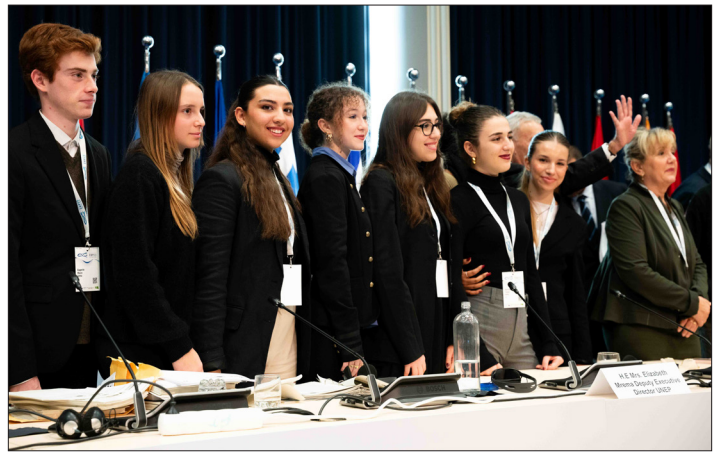
Students from Italian high school, Liceo Ginnasio Tasso, Rome

and panelists further debated whether policies should focus on degrowth in developed countries and moving away from GDP as an indicator of how well economies are doing, with one panelist noting this was "the elephant in the room."