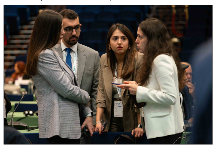
Delegates from Türkiye confer