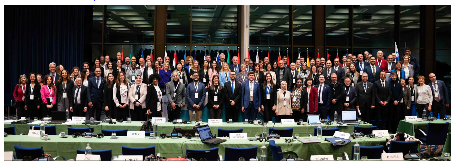
COP 23 Participants