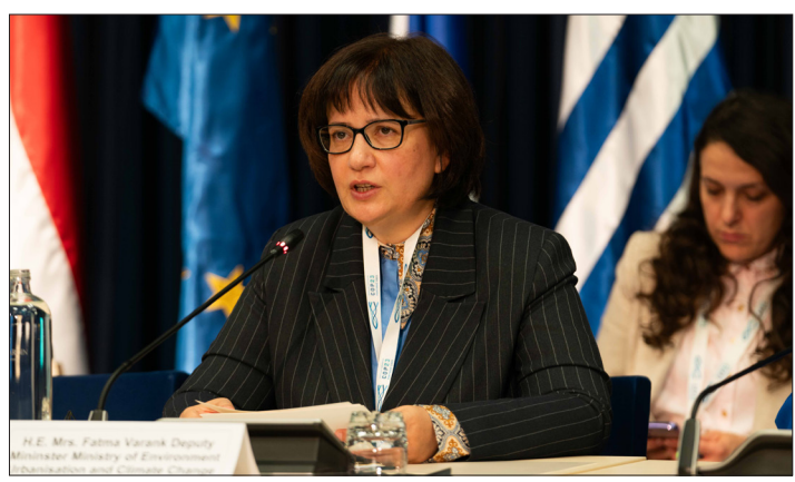
Fatma Varank, Deputy Minister of Environment, Urbanization and Climate Change, Türkiye, and President of the COP Bureau

Protocol), which was adopted in 1994 and entered into force in 2011;