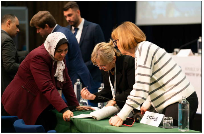
Delegates and the Secretariat consult prior to one of the sessions

Regional Harmonized Procedures for the Uniform Implementation of the Ballast Water Management Convention in the Mediterranean Sea: On Tuesday, the Regional Marine Pollution Emergency Response Centre for the Mediterranean Sea (REMPEC) introduced the document (UNEP/MED IG.26/14), noting links with the Ballast Water