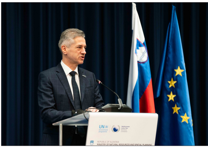
Robert Golob, Prime Minister of Slovenia

Robert Golob, Prime Minister of Slovenia, pointed to the many interests that converge in the Adriatic Sea, a region where ships, railways, roads, and pipelines "lead to the heart of Europe," and praised the Barcelona Convention as a global example of how to address environmental and social challenges. He highlighted Slovenia's "water diplomacy" as a tool for regional integration in Europe and said it would be, together with climate change, at the core of the country's actions as a newly elected member of the UN Security Council.