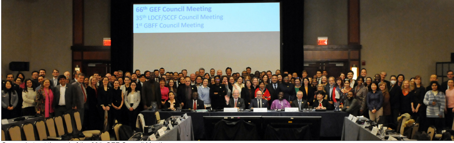
Group photo at the end of the 66th GEF Council Meeting

Second Session of the SIDS4 Preparatory Committee: The second session of the Preparatory Committee for SIDS4 will discuss substantive preparations for the Conference, including