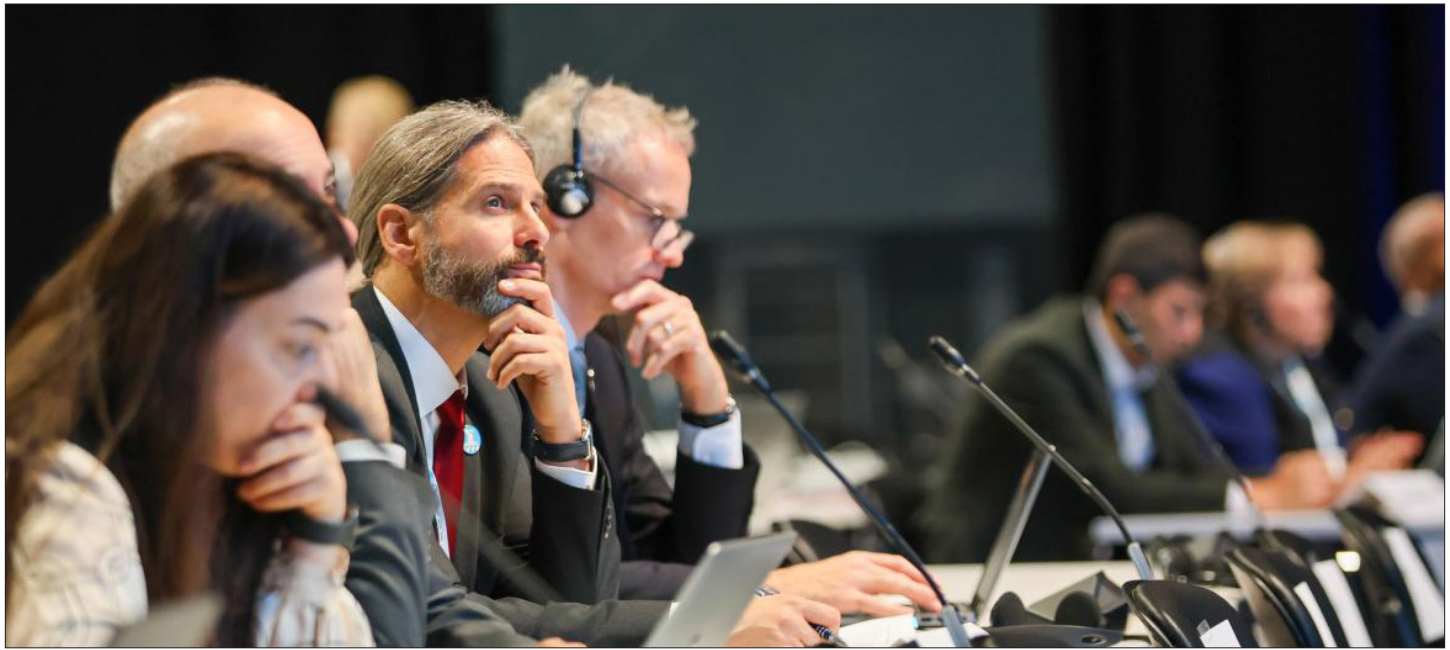
Delegates following the process

adopts the decision on promoting equal and effective participation of all Parties in sessions of the MOP and other meetings under the Convention through translation and interpretation into Arabic, Chinese, and Spanish (ECE/ MP.WAT/2024/9).