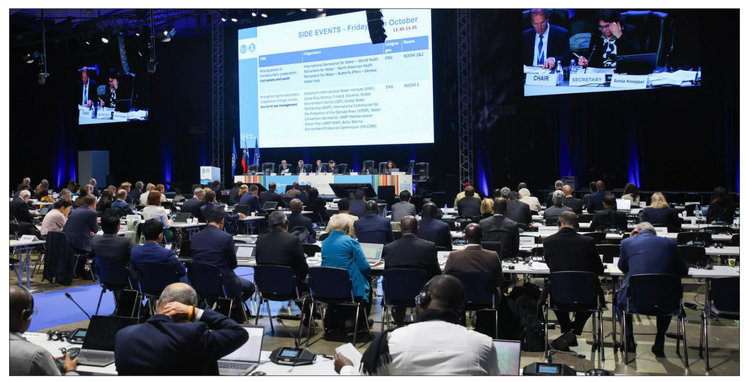
View of the room during the morning plenary

Nations Economic Commission for Europe (UNECE). More than 500 participants from 100 countries participated, representing Parties and non-Parties, UN agencies, research organizations, multilateral development agencies, the private sector, and civil society.