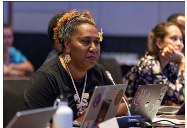
Viva Tatawaqa, Pacific Feminists Defending the Living Planet

BHUTAN said investing in subregional bodies is the most effective strategy for sustainable solutions, and called for strengthening UNEPs relationship with subregional organizations, who are the "translators of global commitments into actions." SINGAPORE noted that subregional groups can