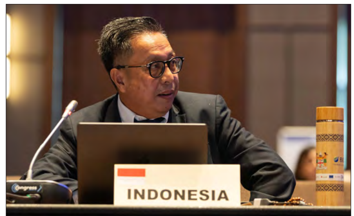
Rasio Ridho Sani , Deputy Prime Minister and Minister of Environment, Indonesia