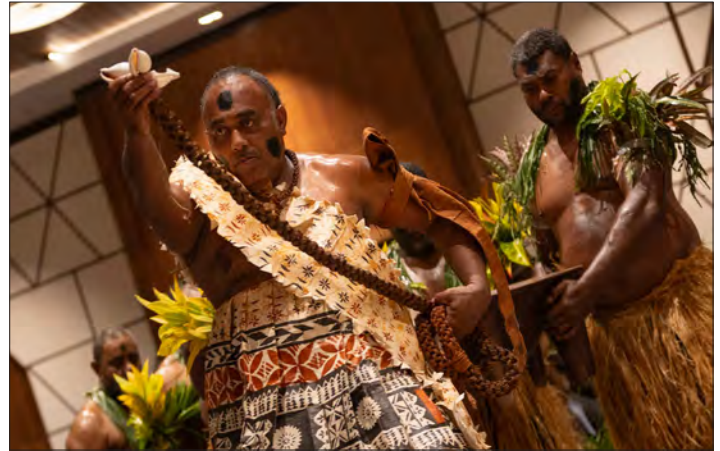
The Ministerial Segment opens with a traditional Fijian performance.

Abdullah bin Ali Al Amri, President, UNEA-7, and President, Environment Authority, Oman, called for urgency and collaboration, and prioritizing: harnessing science for action, tied to the local context; fostering equitable progress that reflects all