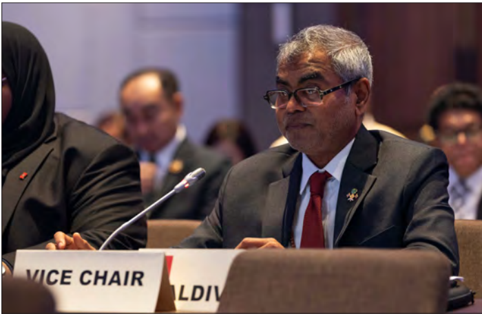
Thoriq Ibrahim, Minister of Tourism and Environment, Maldives

for full, effective, and inclusive engagement. Delegates adopted the agenda.