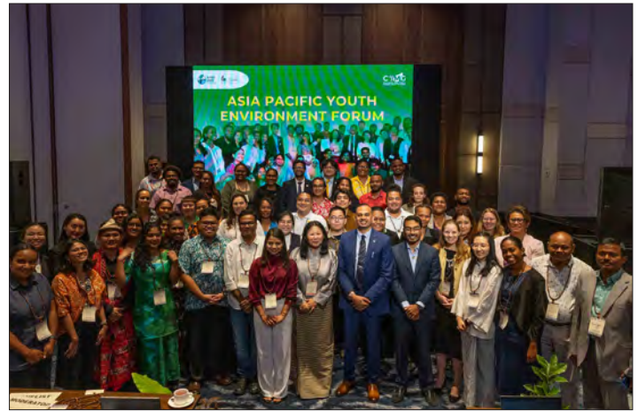
Youth delegates attending the Asia-Pacific Youth Environment Forum gather for a family photo.

Fifth Forum of Ministers and Environment Authorities of Asia Pacific: This meeting convened from 1-5 October 2023 in Colombo, Sri Lanka, on the theme of “Effective, inclusive, and sustainable multilateral actions to tackle climate change, biodiversity loss and pollution.” In line with this theme, the meeting put forward a draft resolution on synergistic approaches to achieve the SDGs, and requested UNEP to produce a report on how to promote synergistic approaches. The meeting reflected many countries’ interest and support for the INC’s work towards a plastics treaty. Discussions also gave focus to problems of snow melt and other environmental impacts of climate change in the Hindu Kush Himalayas. The CYMG advocated for the rights of children and youth to a clean and healthy environment, and for their active participation in shaping a cleaner and healthier world.