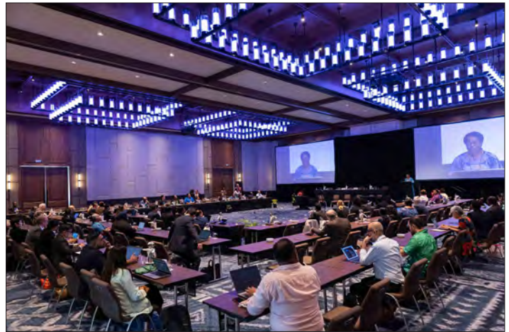
Delegates gather for the Science-Policy-Business Dialogue.

The dialogue discussed follow-up action to transform the region’s prospects including by: developing a short list of scalable solutions such as technologies and business models to be