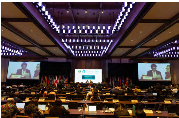
Delegates during the Ministerial Segment

Closing: In closing remarks, Mrema said the Forum had been remarkable for the unprecedented level of participation from Pacific countries, which provided an invaluable contribution to the dialogue, and served as a milestone on the way to UNEA-7. She warmly thanked all delegates, participants, and organizers for their efforts, and the Australian government for its support