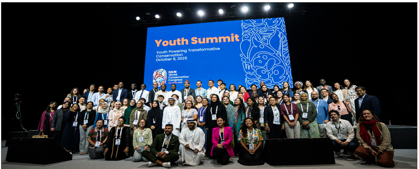
Group photo at the end of the Summit