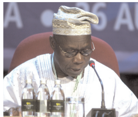
Olesugun Obasanjo, President of Nigeria, states that the African process for the development and protection of the marine and coastal environment is a GEF medium size project aimed at identifying and addressing causes of marine and coastal degradation.

Heherson Alvarez, Minister of Environment of the Philippines, called on participating African countries to share knowledge and experience with East Asian countries. He expressed hope that East Asia would develop a similar partnership.