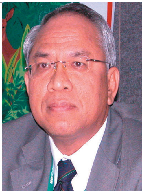
Dato' Suboh Mohd Yassin, Ministry of Natural Resources and Environment, Malaysia, emphasized that the Heart of Borneo initiative is another important building block in achieving the 2010 target of reversing biodiversity loss

In the ensuing discussions, representatives from the UK, the Netherlands, the EC and the CBD Secretariat commended the HOB initiative and expressed support for its implementation. Participants also raised issues concerning illegal logging and unsustainable conversion to oil palm plantations.