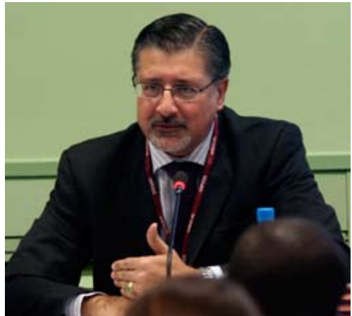
Adnan Amin, CEB, presented the CEB Climate Action Framework, which addresses, inter alia , adaptation, capacity building, technology transfer, and reduction of emissions from deforestation and degradation.

Participants discussed: the need for both formal and practical on-theground training; the problem with high staff turnover; the need to listen to countries regarding their capacity building needs; and the need to include education programmes for youth.