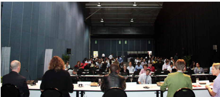
Panelists discuss the main findings of CIFOR's Global Comparative Study on REDD+.