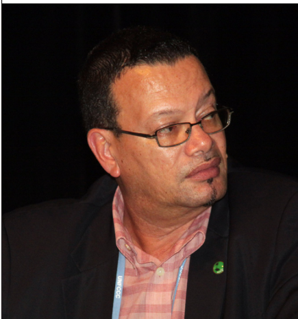
Ronald Jumeau, Seychelles' Ambassador, highlighted the need to decrease vulnerability to climate change.

Participants discussed: essential need for government policies to adapt; role of women, especially in the rural communities and the need to empower them via urgent measures; the need for Africa to continue to adapt even without international support; risks involving crop production in Africa due to climate change impacts; how to build on existing capacities in the region; need to strengthen local institutions; and the importance of finance for adaptation.