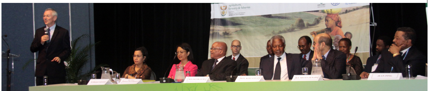
Panelists discussed the issue of better management of natural resources as tool which will make agriculture more productive.