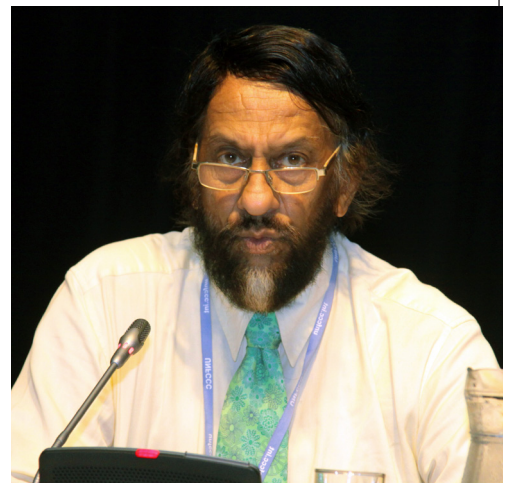
Rajendra K. Pachauri, Chairman, IPCC, explained that economic costs for loss of human life and cultural heritage, and ecosystem services have not been taken into account.