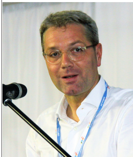
Norbert Röttgen, Federal Minister for the Environment, Nature Conservation and Nuclear Safety, compared climate change negotiations to "running a marathon."

Organized by the German Federal Ministry for the Environment, Nature Conservation and Nuclear Safety (BMU)