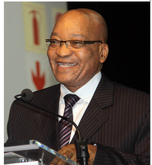
Jacob Zuma, President of South Africa, said climate-smart agriculture seeks to enhance productivity by enhancing resilience in the sector.

Jacob Zuma, President of South Africa, said climate-smart agriculture seeks to enhance productivity and reduce vulnerability to climate change with techniques such as: conservation, crop rotation, agroforestry, water management, and innovative practices such as improved weather forecasting. He noted that despite recent economic growth in many countries in the region, poverty continues to be an overwhelming challenge due to lack of: safe drinking water; sanitation; irrigation for crops; and access to energy.