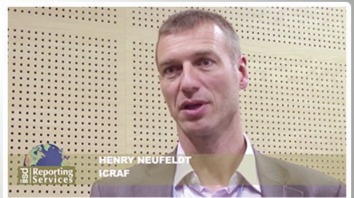
Scaling Up Climate Smart Agriculture (CSA): Policies, Development and Mitigation Potentials Presented by the World Agroforestry Centre (ICRAF)