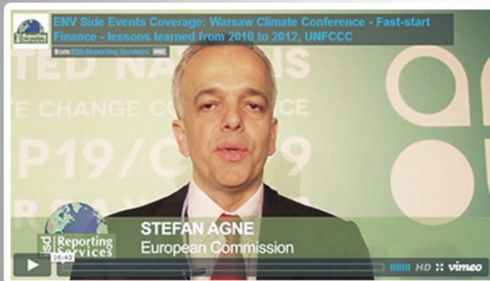
Fast-Start Finance - Lessons Learned 2010-2012 Presented by the UN Framework Convention for Climate Change (UNFCCC) Secretariat