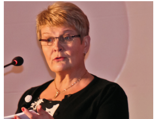
Maud Olofsson, Minister for Energy and Enterprise, Sweden