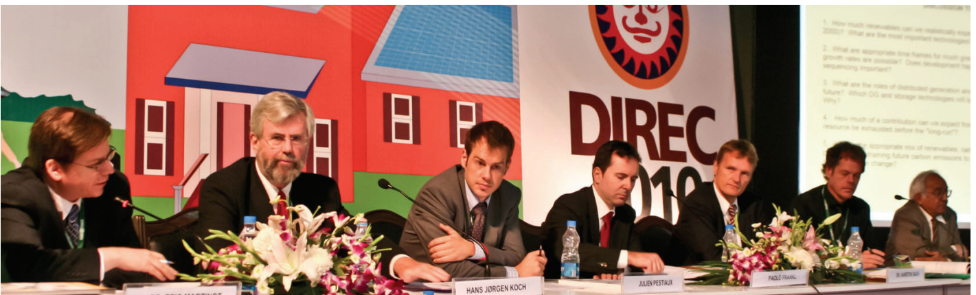
In a session on renewable energy scenarios, participants discussed time frames and costs of various scenarios related to the expected massive transition to renewable energy in the coming decades.