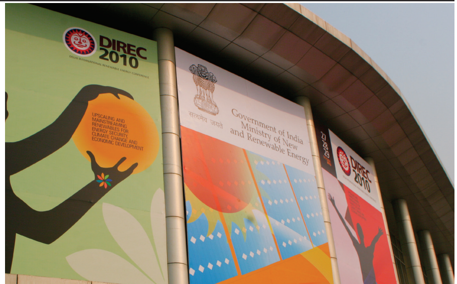
Enormous banners adorned the outside of the conference center

The Delhi International Renewable Energy Conference (DIREC 2010) opened on Wednesday in New Delhi, India. Convened by the Indian Ministry of New and Renewable Energy, DIREC 2010 is the fourth in a series of conferences on international renewable energy. DIREC will provide a forum for discussing, inter alia , scaling-up renewables, mobilizing finance for innovation and deployment, and the benefits of collaboration and knowledge sharing at the international level.