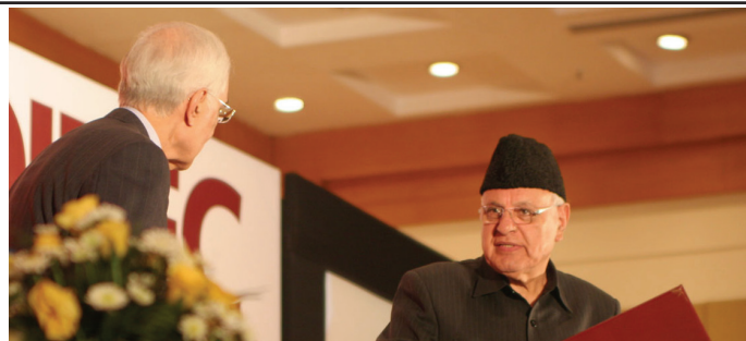
Farooq Abdulla (right), Union Minister, MNRE, India, accepting the DIREC Declaration from Mohamed El-Ashry, REN21.

At UNCED, delegates adopted Agenda 21, an action plan for implementing sustainable development. Agenda 21 addresses sustainable energy, in Chapter 9, on protecting the atmosphere,