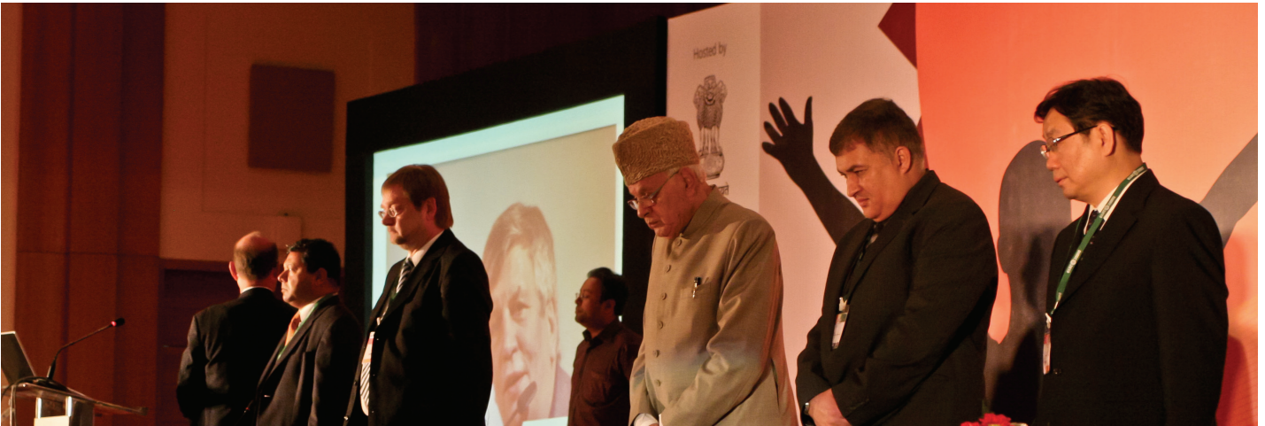
The dais observing a moment of silence for the recently departed renewable energy icon, Hermann Scheer

the power industry; investing in smart grids and long distance transmission; and establishing predictable and transparent incentives.