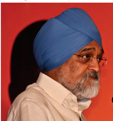
Montek Singh Ahluwalia, Deputy Chairman, Planning Commission, India