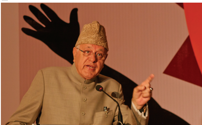
Farooq Abdullah, Union Minister for New and Renewable Energy, India