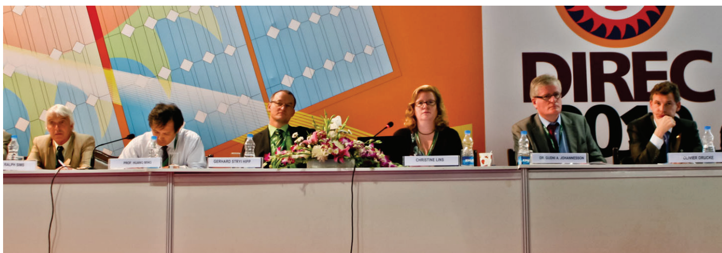
The track continued by focusing on markets for solar cooling and heating pumps, policy frameworks for heating and cooling and product development and market research.

INITIATIVES TO CATALYZE AND SCALE UP INVESTMENT IN RENEWABLE ENERGY: During this session moderated by Virginia Sonntag-O’Brien, REN21, Jonathan Maxwell, Sustainable Development Capital LLP, described Critical Mass, a project to promote public-private