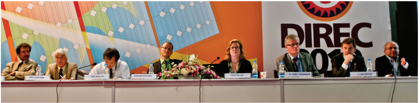
A discussion on heating and cooling technologies focused on markets for solar cooling and heating pumps, policy frameworks for heating and cooling, and product development and market research.

meeting concluded with several recommendations, including the need to: establish a global access fund to target chronic problems of access to energy; develop clear sustainability guidelines and standards for biofuels; strengthen regional research capacities through networks; and establish UN Energy and industry partnerships. IISD RS coverage of the Forum can be found at: http://www.iisd.ca/ymb/energy/greb2009/html/ymbvol128num3e.html