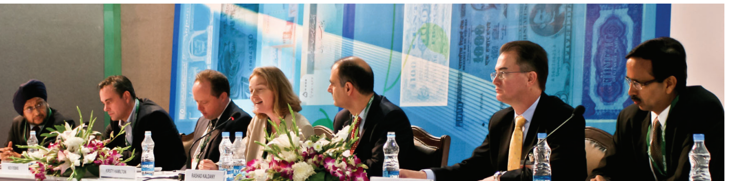
In a session on financing deployment at scale, participants discussed overcoming hurdles to renewable energy growth, such as lack of adequate power infrastructure, unpredictable government support, and the need to redraw financing structures to accommodate the nuances of renewables.

Rajendra Pachauri, Chair, Intergovernmental Panel on Climate Change (IPCC), said he hoped UNFCCC COP 16 would put climate change adaptation "on track" and emphasized that reducing greenhouse gases and incorporating renewables into the energy matrix are crucial for climate change mitigation. He suggested that COP 16 could be useful for advancing progress on identifying appropriate prices for carbon. Energy security, Pachauri added, has a number