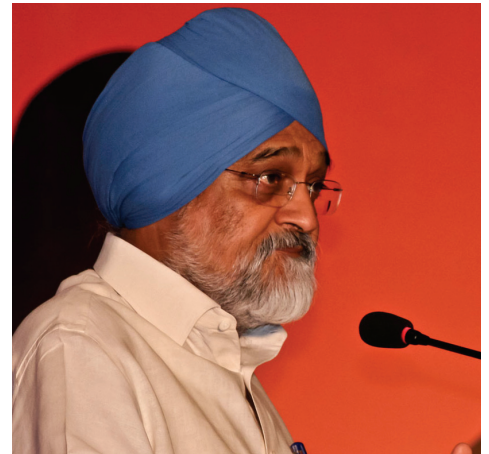
Montek Singh Ahluwalia, Deputy Chairman, Planning Commission, India