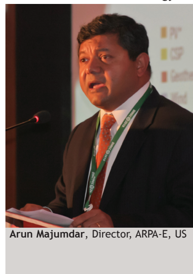
Arun Majumdar, Director, ARPA-E, US

CEO roundtable moderator Steve Sawyer said discussions had highlighted, inter alia : lowering costs of renewable energies to make them more competitive; scaling up wind and solar energy; assisting the industry to reach maturity; sending clear government signals to markets regarding renewables and fossil fuels; and addressing subsidies to level the energy playing fields and develop domestic renewable energy markets.