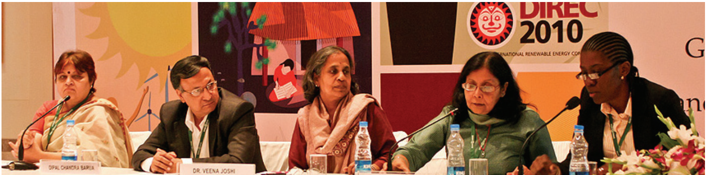
Woman Empowerment: This session discussed the role of women in renewable energy markets, including barriers to obtaining credit, delivery of energy services, and improving household life and health.

standards and overpopulation, which together have led to several mega-trends including: unsustainable energy demands; petro-dictatorships; “global weirding”; energy poverty; and extreme biodiversity devastation. He explained that the universal solution to these problems is abundant, cheap, clean and reliable “electrons” and called on countries to establish ecologies for innovation and to embark on an “earth race” to seek a clean and abundant way to power the world. He added that innovation and technology, coupled with cooperation and competition, are the keys to saving the planet.