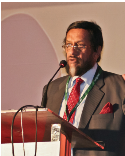
Rajendra Pachauri, Director General, TERI, and Chair of the IPCC