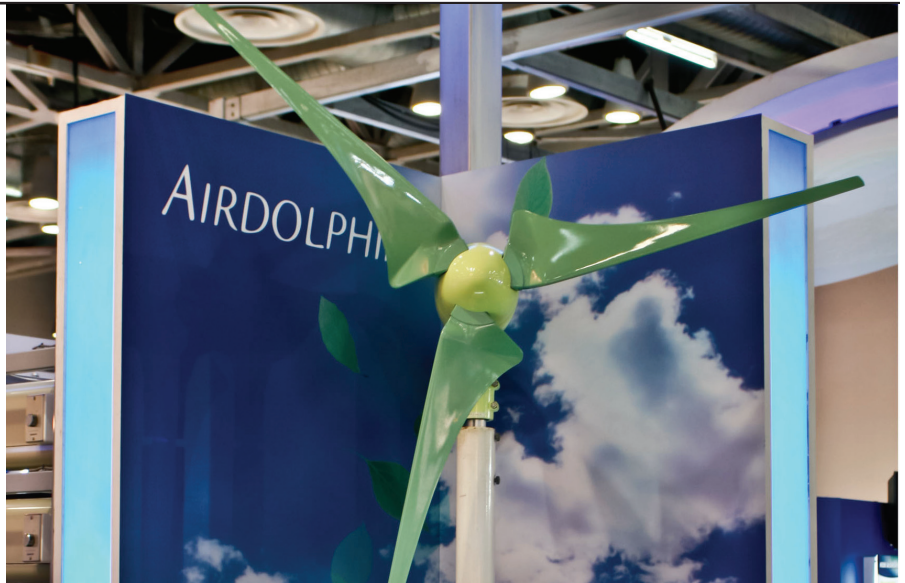
A new wind turbine design on display at the DIREC trade fair.

On Thursday, participants at DIREC convened throughout the day in thematic sessions organized around four main tracks: technology and infrastructure; policy; finance; and renewables access and the Millennium Development Goals (MDGs). Parallel workshops also took place on biofuels and promoting rural entrepreneurship for enhancing access to clean lighting options. The renewable energy exposition and trade show continued.