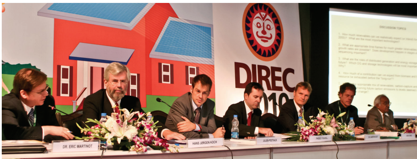
The renewable energy scenarios panel discussed time frames and costs of various scenarios in light of the expected massive transition to renewable energy in the coming decades.