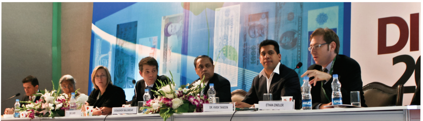
The panel on financing innovation - projects, businesses and technologies discussed the roles for public and private finance, and finance models for supporting innovation.

On power technology and infrastructure, energy and grid integration of renewable energy, reliability of supply, and grid stability and infrastructure were discussed. On heating and cooling technologies, the advantages of district heating