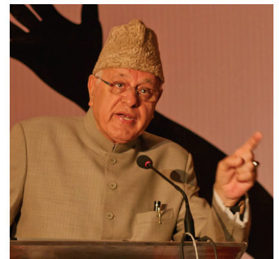
Farooq Abdullah, MNRE, India

Supporting Policies (On-Grid): Panelists called for the removal of trade barriers that keep the cost of renewable energy technologies unnecessarily high. According to some, the creation of sustainable markets for renewables would require a combination of policies, including rules for grid access. Some panelists highlighted national experiences in promoting renewable energy, including in India and Japan.