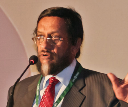
Rajendra K Pachauri, Director-General, The Energy and Resources Institute (TERI) and Chair, Intergovernmental Panel on Climate Change (IPCC)

Renewables in India: This session focused on potentials