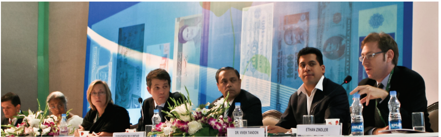
The financing innovation - projects, business and technologies panel discussed public and private financing options to enable wider uptake of renewable energy technologies.