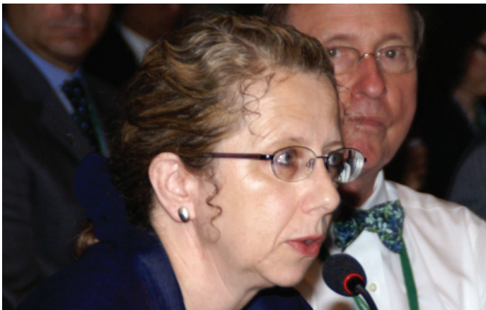
Inger Andersen, World Bank

development agendas, and the UN report “Energy for a Sustainable Future” on universal access to energy and energy efficiency.