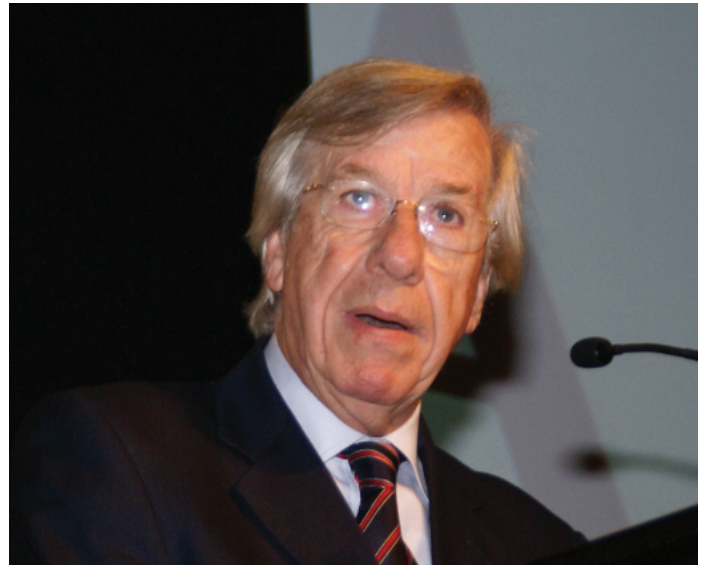
Danilo Astori, Vice President of Uruguay

Monique Barbut underscored the unprecedented fifth replenishment of the GEF (GEF-5), and described GEF transformations towards a more effective, transparent, accessible and equitable mechanism. Among goals achieved, she highlighted the creation of system for a transparent allocation of resources (STAR) and the simplification of project approval processes, as a “driving force behind