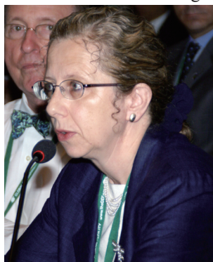
Inger Andersen, incoming World Bank Vice-President for Sustainable Development