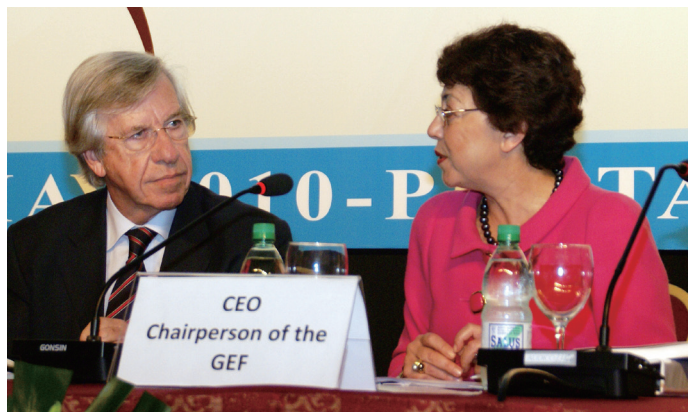
L-R: Danilo Astori, Vice President of Uruguay; and Monique Barbut, GEF CEO and Chairperson

FIFTH GEF REPLENISHMENT MEETINGS: GEF donors met six times, from March 2009 to May 2010, to discuss the fifth GEF Replenishment. The replenishment negotiations led to an agreement in which over 30 countries pledged a total of US$4.25 billion to fund GEF projects. The financial pledges include some of the Fast Start Financing discussed at the Copenhagen Climate Change Conference, and will feature the creation of a Sustainable Forest Management-REDD Plus initiative focused on reducing emissions from deforestation and forest degradation in developing countries, as well as conservation, sustainable forest management, and enhancement of forest carbon stocks.