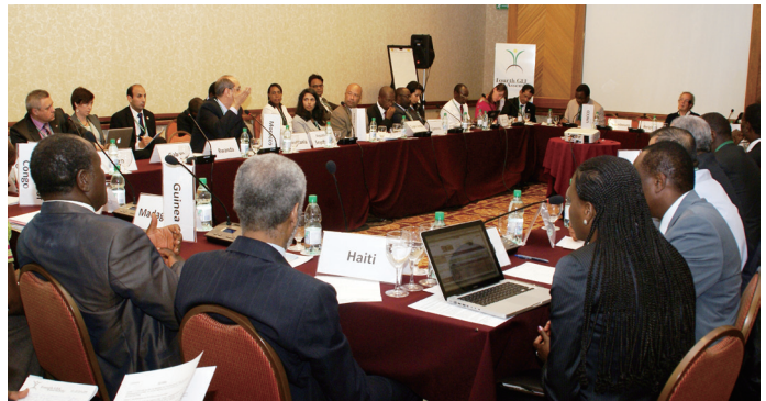
During the roundtables delegates discussed two main themes, namely: improving efficiency and effectiveness of GEF; and enhancing country ownership of GEF projects

Many participants insisted on the importance of strengthening countries' capacities to engage in GEF-related matters while others noted that the GEF is still largely unknown at the country level. Some suggested the GEF Secretariat should improve its communication efforts. Participants emphasized the need to strengthen the focal points and involve them in project follow-up; and that well-functioning national GEF committees could become instrumental in expanding country ownership.