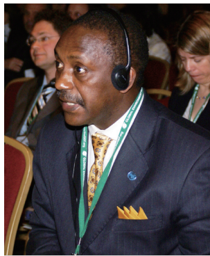
Kandeh K. Yumkella, Director-General, UNIDO

Constituencies from Africa: Algeria, for four North African countries, welcomed the GEF reforms, called for more flexibility in GEF projects and more equity in resource allocation; reiterated the voluntary nature of national plans,