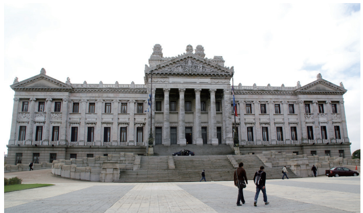
On Thursday, 27 May 2010, an event celebrating the International Year of Biodiversity (IYB) was co-hosted at the Legislative Palace in Montevideo, Uruguay, by the GEF and the Uruguayan Council for International Relations (CURI)

FIFTH GEF ASSEMBLY: The GEF Assembly is expected to take place in 2014. The venue will be confirmed. For more information contact: GEF Secretariat; tel: +1-202-473-0508; fax: +1-202-522-3240/3245; e-mail: secretariat@thegef.org ; Internet: http://gefassembly.org/j2/index.php