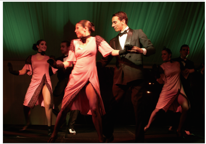
Tango exhibition during Tuesday's GEF reception

The Assembly featured plenary sessions and a series of roundtables in different languages to discuss two broad areas of reform, namely: enhancing country ownership; and improving the effectiveness and efficiency of the GEF. Alongside these, participants took part in numerous side events and in an exhibition area featuring the work of donors, recipients, civil society, international organizations, and implementing agencies. The host country also organized several visits to GEF project sites. A special event to celebrate the International Year of Biodiversity took place on 27 May in the Uruguayan Parliament (for IISDRS coverage of this event, see: http://www.iisd.ca/ymb/gef/gefassembly4/ ).