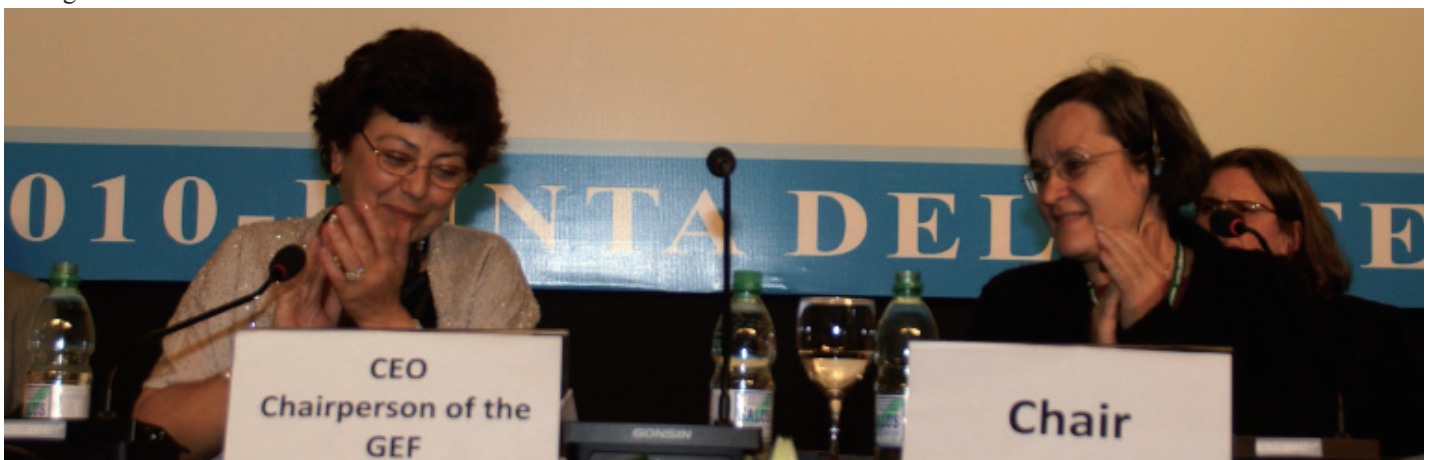
Monique Barbut, GEF CEO, and Graciela Muslera, Minister of Environment, Uruguay, Chair of the fourth GEF Assembly

A grantee from Peru discussed conservation of local varieties of cotton, and the digging of a well to bring clean water to her family along with new cooking technologies that produce less smoke. A grantee from Fiji discussed environmental education for climate change adaptation on a remote island. A member of the NGO network lauded the work of local NGOs as custodians of the environment.