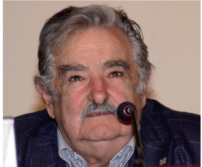
José Mujica, President of Uruguay

The Fourth Global Environmental Facility (GEF) Assembly convened in the morning in a series of side-events, and in plenary in the afternoon. President José Mujica of Uruguay addressed the plenary, after which constituencies continued presenting their respective positions. Delegates discussed Kosovo as a GEF member, adopted a proposal of Amendment to the Instrument for the Establishment of the Restructured GEF and took note of a series of reports.