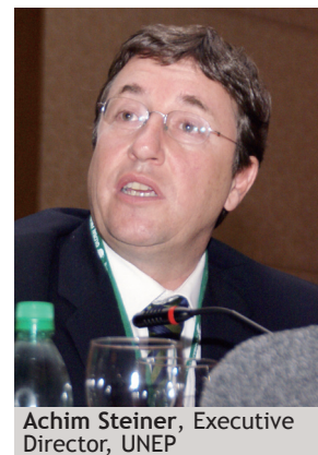
Achim Steiner, Executive Director, UNEP

Achim Steiner, Executive Director of the United Nations Environment Programme (UNEP), welcomed the GEF replenishment, and highlighted how far we are from meeting countries' commitments made at Rio. He stressed the challenge of transforming economies and moving away from subsidizing unsustainable activities, such as the US$27 billion annually spent on fishing subsidies. He urged the GEF to consider its strategic focus to go beyond financing implementation activities.