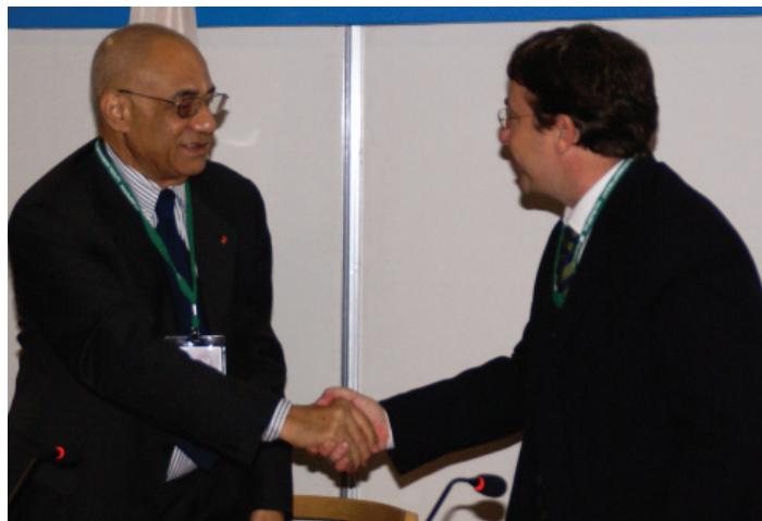
Achim Steiner, UNEP Executive Director and, Kacou Gervais, Minister of Foreign Affairs of Côte d'Ivoire

Kiribati said that indigenous peoples know what projects are needed in their home regions. A CSO representative said NGOs and indigenous peoples should have more access to the GEF decision-making process. Finland mentioned increased