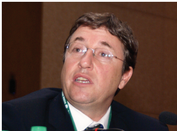
Achim Steiner, Executive Director, UNEP

Costa Rica, for four Central American countries, Mexico and Venezuela, highlighted biodiversity and desertification as regional coordination topics, with the Mesoamerican corridor as an example of regional coordination, and said GEF projects and coordination mechanisms should be participatory, transparent and synergetic.