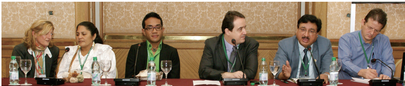
The dais during the side event on “Global Environmental Benefits through Innovative Community Approaches at the Local Level - SGP”