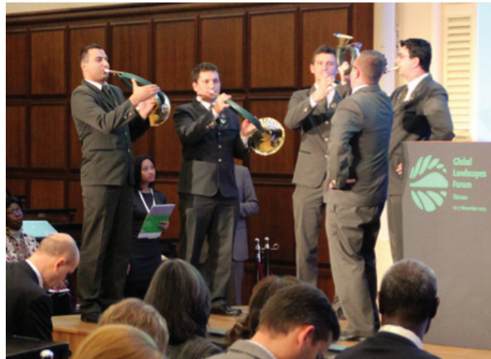
A brass band opened Sunday's plenary session with a short rendition of a traditional Polish theme.

This report provides an overview of the discussions that took place in all the plenary sessions, as well as selected parallel discussions and technical and networking sessions. It also