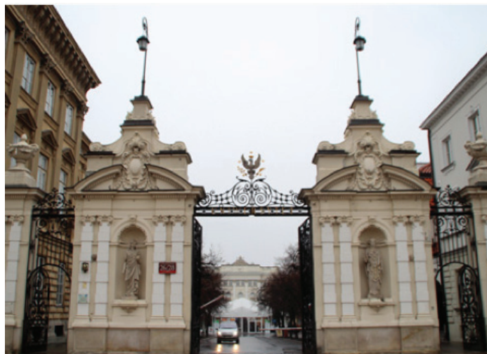
University of Warsaw, venue for the GLF