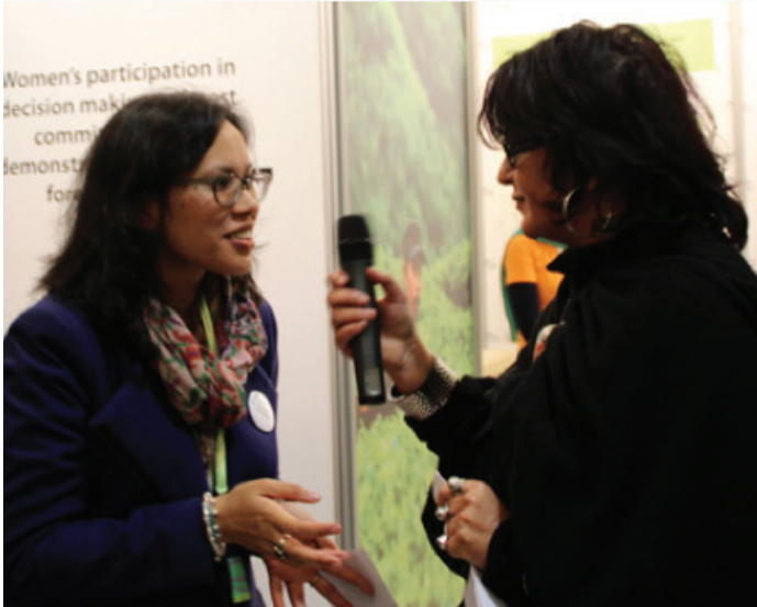
Participants at the Gender Café