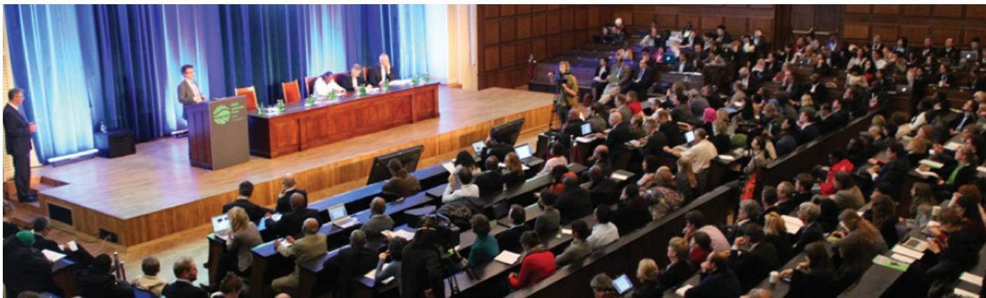
A view of the room during the high-level session