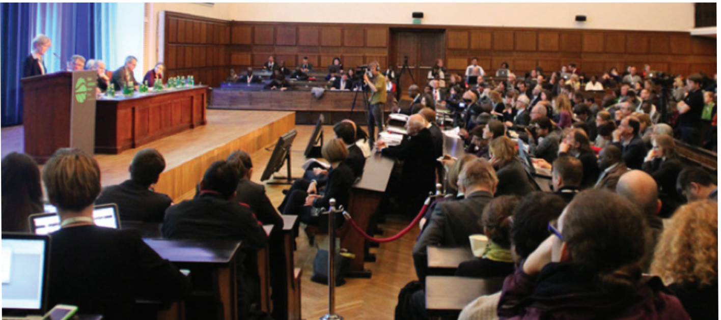
A view of the room during the opening plenary