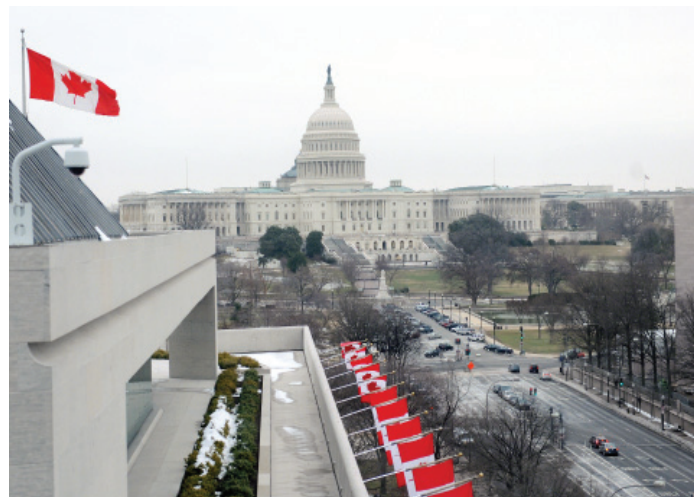
A view of the US Capitol and the Canadian embassy from the Newseum, where the Dialogue was held

UNFCCC COP 20 and CMP 10: The 20th session of the Conference of the Parties (COP 20) to the UNFCCC and the 10th session of the Conference of the Parties serving as the Meeting of the Parties (CMP) to the Kyoto Protocol will take place in Lima, Peru. dates: 1-12 December 2014 location: Lima, Peru contact: UNFCCC Secretariat phone: +49-228-815-1000 fax: +49-228-815-1999 email: secretariat@unfccc.int www: http://unfccc.int