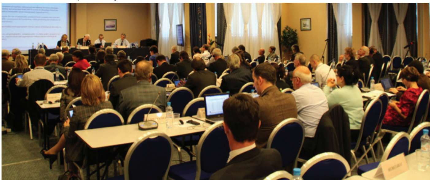
A view of the room during plenary

RATIFICATION, ACCEPTANCE, APPROVAL OR ACCESSION: On Friday, the legal expert group recommended lifting the brackets around the subparagraph on accession and streamlining the article’s opening subparagraph to read “The