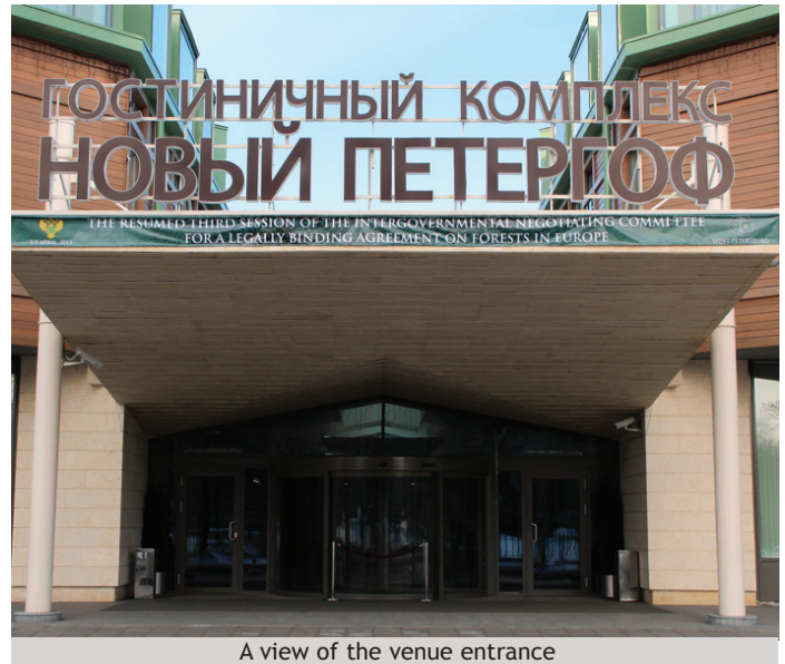
A view of the venue entrance

The INC-Forests process was launched by the 2011 Ministerial Conference on the Protection of Forests in Europe (FOREST EUROPE), held in Oslo, Norway (Oslo 2011). FOREST EUROPE is a high-level political initiative that was founded in 1990 to work towards the protection and sustainable management of forests throughout Europe. Forty-six European countries and the EU, in cooperation with a range of international organizations, participate in FOREST EUROPE.