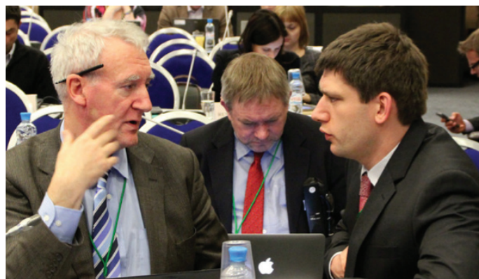
Delegates consulting during the session

TERMS AND DEFINITIONS: This article was discussed on Thursday and Friday in meetings of the plenary, and by the contact group on Thursday night.