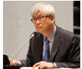
Ahn Nam-sung , President, Korea Institute of Energy Technology Evaluation and Planning

Ahn also outlined breakthroughs in: ultra-efficient solar power; offshore wind turbine technology; hybrid renewable energy systems; energy management systems that will link home and office appliances through the 'internet of things'; and advanced thermal storage systems. He encouraged ministers to introduce a range of policy initiatives to advance renewable energy deployment, comparing their work with that of orchestra conductors who produce music by harmonizing different instruments.