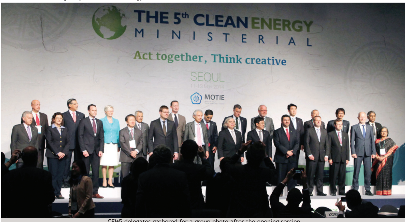
CEM5 delegates gathered for a group photo after the opening session