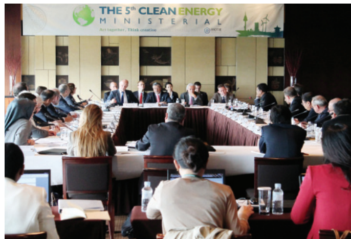
Roundtable on Renewable Energy for Sustainable Growth and Employment