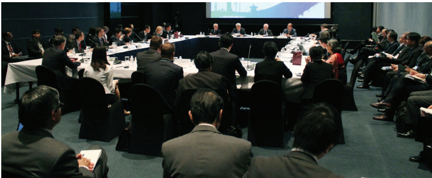
Roundtable on Energy Storage Systems (ESS) - Challenges and opportunities

Discussions addressed a range of topics, including: the need to bolster market confidence in ESS technology, as well as the potential contribution of ESS in managing renewable energy