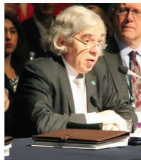
Ernest Moniz, US Secretary of Energy

Welcome remarks and introduction: The fifth Clean Energy Ministerial (CEM5) opened on Monday morning, 12 May. Before the official start of the meeting, US Secretary of Energy Ernest Moniz invited everyone to observe a moment of silence in memory of the loss of young lives in the Sewol sea ferry disaster.