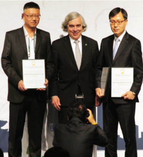
Global Lighting and Energy Access Partnership Award winners with Ernest Moniz, Secretary of Energy, United States