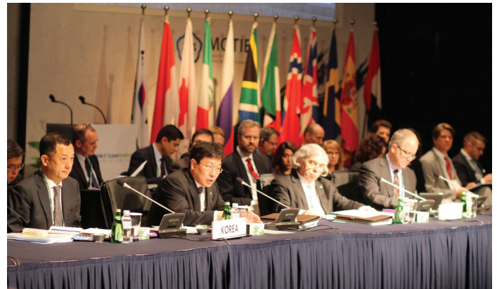
Yoon Sang-jick, Minister of Trade, Industry and Energy, Republic of Korea, opened the Ministerial

The CEM grew out of the Major Economies Forum on Energy and Climate in July 2009, which agreed to launch a global partnership to drive transformational low-carbon and climate-friendly technologies. At the Conference of Parties to the UN Framework Convention on Climate Change (UNFCCC) that took place in Copenhagen, Denmark in December that year, United States (US) Secretary of Energy Steven Chu announced that he would host the first CEM in Washington DC.