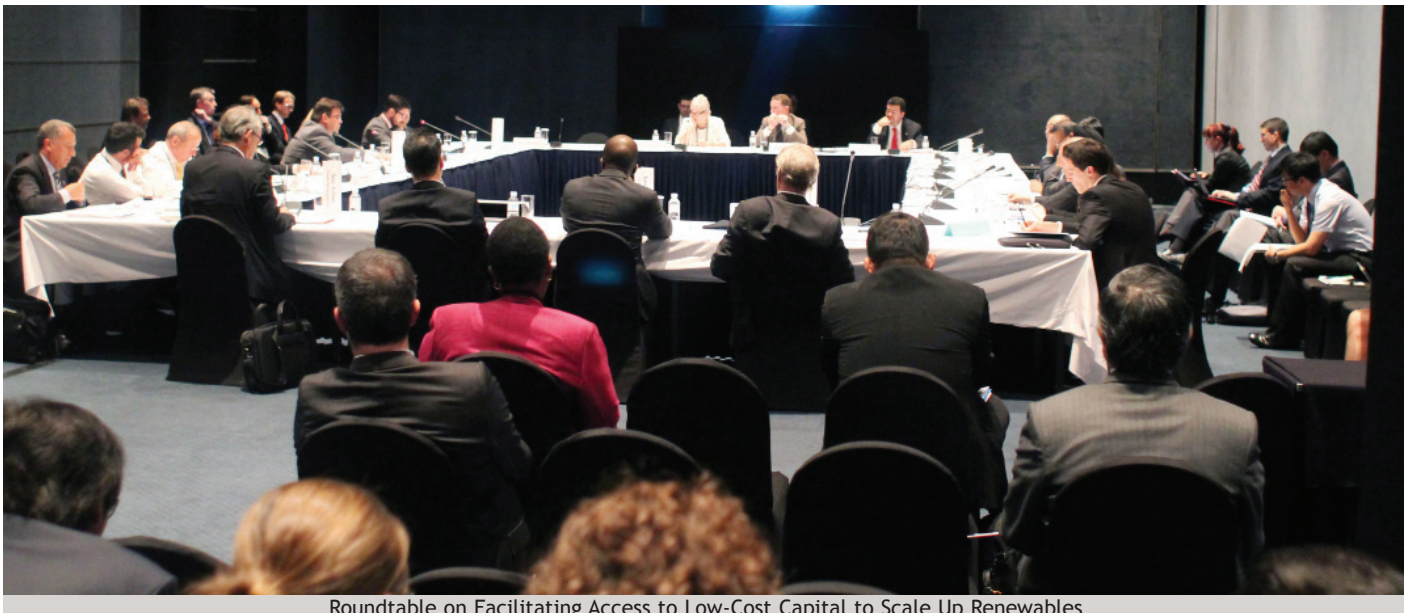
Roundtable on Facilitating Access to Low-Cost Capital to Scale Up Renewables

Delegates also noted that action would need to take place in a non-‘business-as-usual’ environment and that the commitment to massively scale up financial flows to developing countries by 2020 stands in marked contrast to the decline in clean energy investment over the last two years.