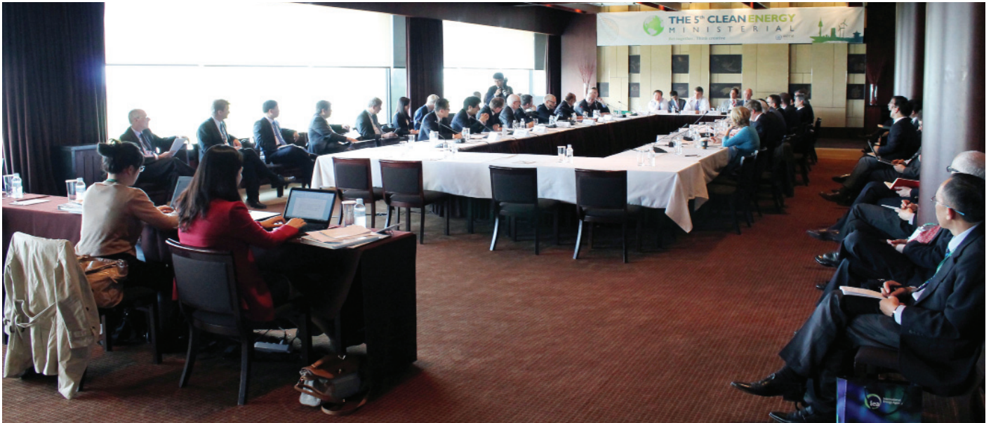
Roundtable on EV Integration in Power Systems

fluctuations in the grid; the importance of scaling up to reduce costs; the value of ESS in addressing existing technical issues, such as managing blackouts and deferring system upgrades in response to increases in peak demand; the need to raise awareness of the full range of different ESS technologies, such as thermal energy storage for district-wide heating, as well as established ESS technologies such as hydropower; pushback from incumbent electricity generators; the need for systems to be ‘agnostic’ in relation to ESS technology type; the potential for smart grids to optimize the contribution of ESS; and the value of developing international certification approaches for maintaining technical quality.