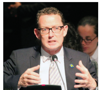
Greg Barker, Minister of State, Department of Energy and Climate Change, UK

Barker outlined a new initiative, the Global Innovation Lab for Climate Finance (the Lab). He noted that the Lab will build on a previous British public-private investment initiative, the Capital Markets Climate Initiative, and will involve other countries, including Germany, Norway and Denmark. He explained that it will be an incubator for private finance ideas, involving senior