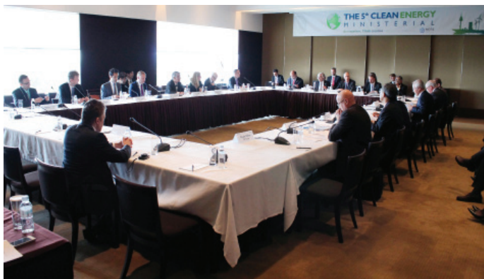
Roundtable on Energy-efficient Cooling and Demand Response