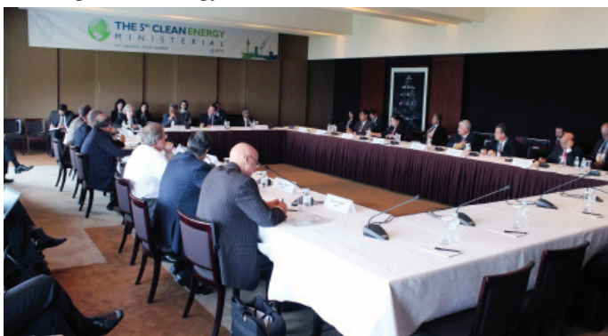
Roundtable on The Energy-Water Nexus - Overview and Relevance for the CEM

Participants called for stronger efforts to research water use and availability, and increased investment in technologies for reuse and recycling of water. They acknowledged the political dimensions of water pricing and customary arrangements around water use. They considered how to incentivize water stakeholders to participate in clean energy pathways, noting that many energy reduction opportunities are water-related. Participants also agreed that the CEM should undertake further work on the energy-water nexus, in particular sustainability considerations and issues around the production and consumption of energy.