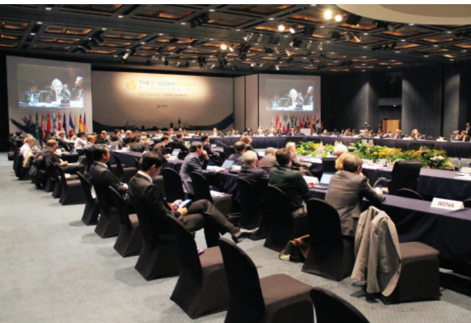
A view of the room during the Ministerial

At the end of the day on Monday, award programmes for three CEM initiatives - Global LEAP, SEAD, and ISGAN - recognized companies that have created innovative smart grid projects and energy-efficient products, including LED lights, off-grid televisions and computer monitors.