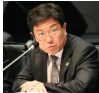
Yoon Sang-jick, Minister for Trade, Industry and Energy, Republic of Korea

Yoon Sang-jick opened the second day of CEM5, outlining closed-door discussions about the CEM and its 13 initiatives.