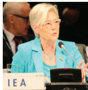
Maria van der Hoeven, Executive Director, IEA

Keynote speeches: Maria van der Hoeven, Executive Director, International Energy Agency (IEA), presented recent developments in clean energy deployment and trend projections to 2050, drawing on the content of the IEA's Tracking Clean Energy Progress 2014 (TCEP 2014) report to be launched later that day.