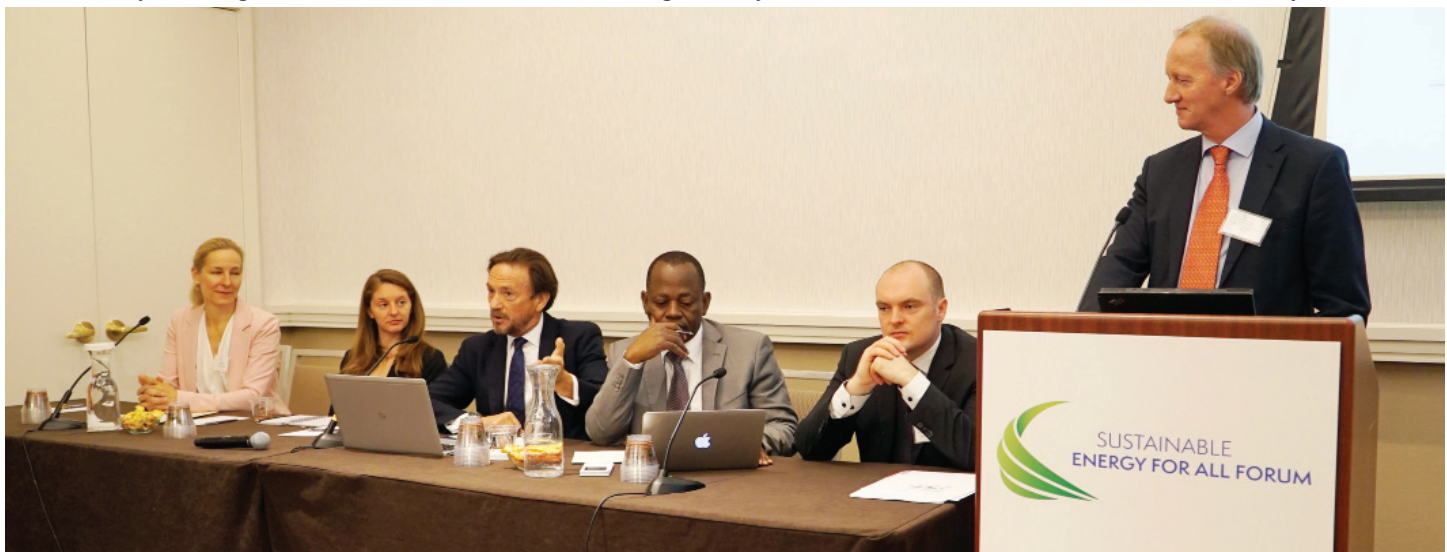
Members of the IRENA Coalition for Action discussed strategies to improve communication of the benefits of renewable energy. The session also showcased the new IRENA virtual market place for renewable energy projects in Africa.