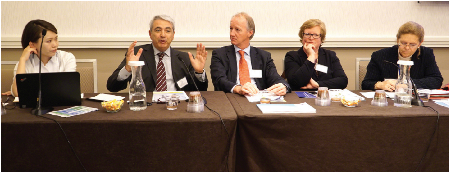
Panelists of the dialogue on Sneak Preview – REN21's Renewables 2015 Global Status Report, addressed the substantial growth of renewable energy in the power sector, noting the slower progress in transport and heating sectors, and suggesting ideas for the way forward.