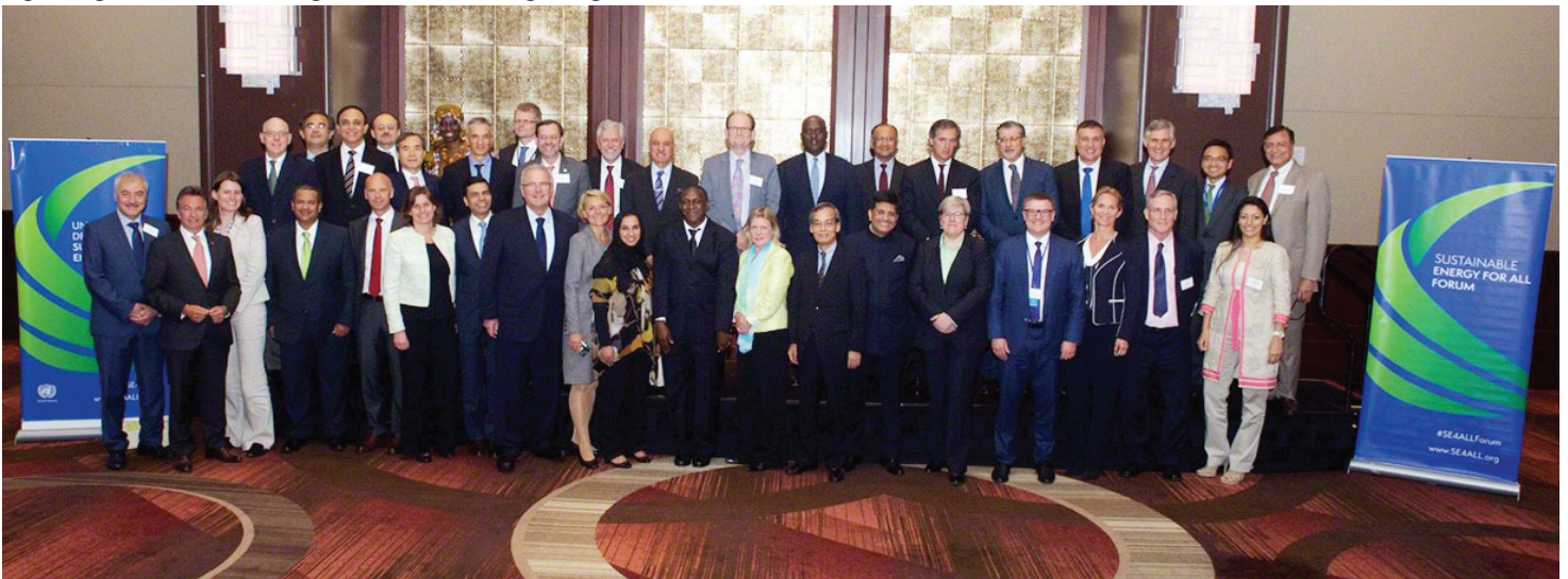
Members of the SE4All Advisory Board