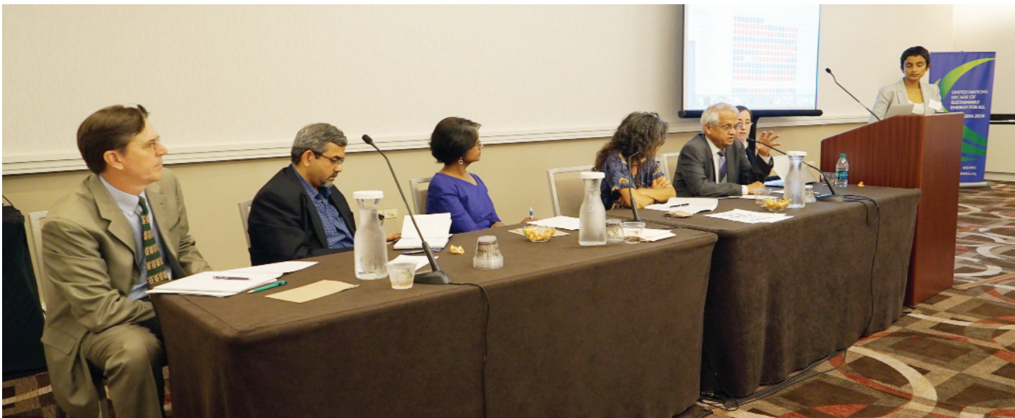
Panelists at the dialogue on the Launch of a Methodology on Short-Lived Climate Pollutants discussed how to quantify and monitor emissions reductions from black carbon.