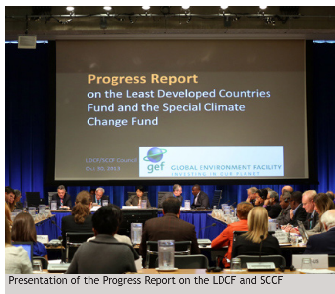
Presentation of the Progress Report on the LDCF and SCCF