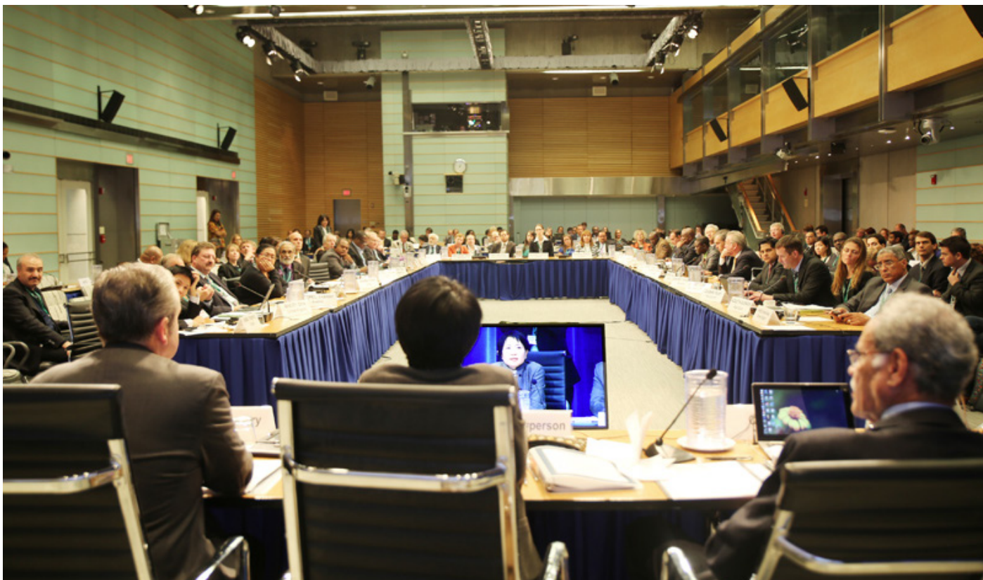
View of the 47th meeting of the GEF Council closing plenary

momentum in support for adaptation would be in jeopardy unless contributions to the LDCF/SCCF are increased, and warned that having so many good projects ready for approval but awaiting funds makes it difficult for countries to plan ahead in their adaptation efforts.