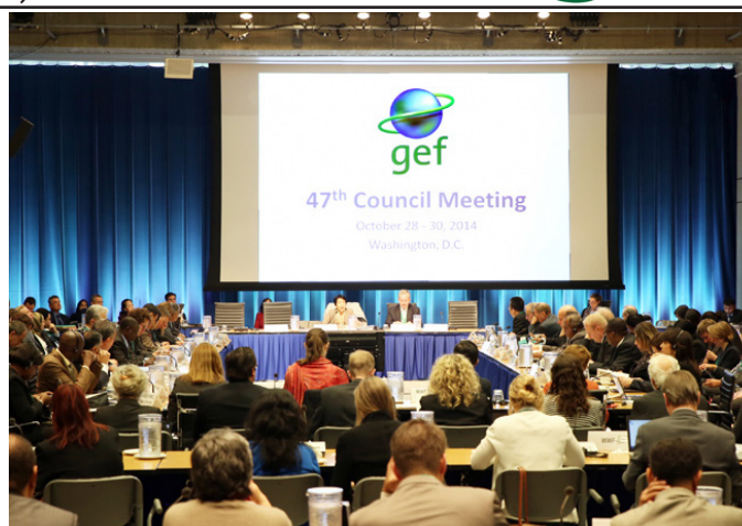
A view of the opening plenary of the 47th meeting of the GEF Council

The LDCF/SCCF Council convened for its 17th meeting on 30 October, and adopted, inter alia , a Work Program for the SCCF that comprises six project concepts, with total resources amounting to US$31.883 million, including SCCF project financing and Agency fees. Switzerland announced that it was sending CHF 1 million for the LDCF and CHF 1.25 million for the SCCF. Norway announced a recent contribution of NOK