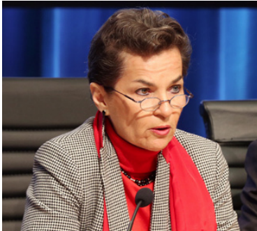
UNFCCC Executive Secretary Christiana Figueres