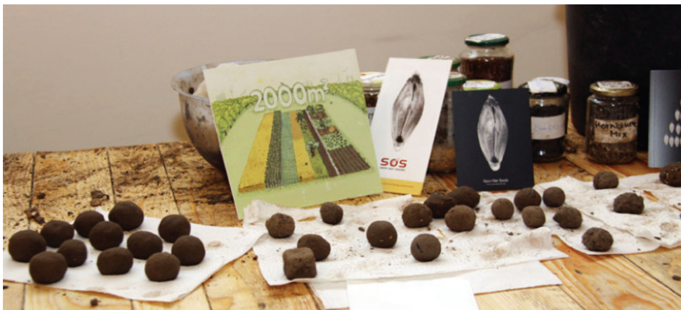
Seed balls from the Save our Seeds (SOS) exhibition