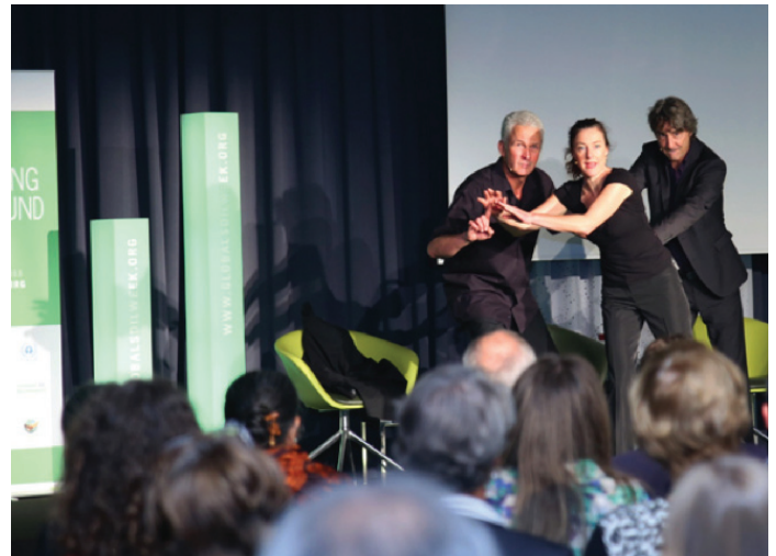
Theatersport Berlin improvisational theater group, opened the kick-off session

This report covers the sessions that took place from 28-30 October. It first provides a brief history of the Global Soil Week and overview of related meetings and initiatives in the past year. It then summarizes discussions that took place during plenary sessions, followed by detailed summaries of 12 of the 22 interactive dialogue sessions held over the three days. After a brief outline of topics discussed during the "open space workshops" on 31 October the report concludes with a list of upcoming meetings.