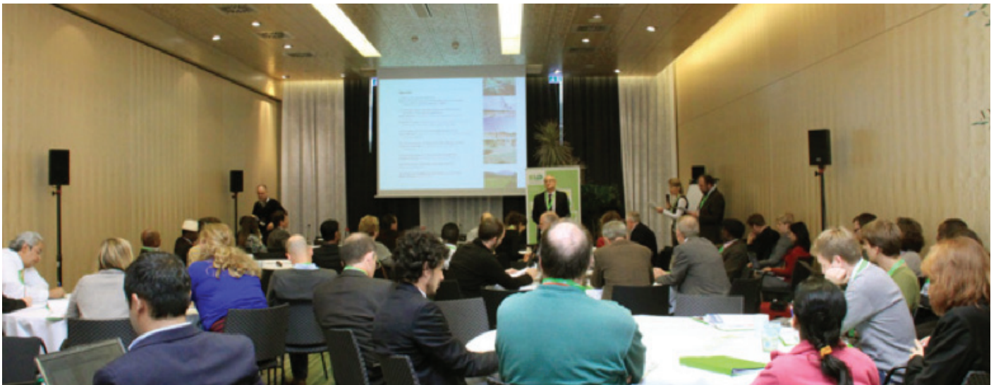
Dialogue session on Economics of Land Degradation (ELD)

environmental impact assessments are inadequate for this. However, many noted that enforcing regeneration policies requires strong leadership, significant financial investment and continuous public pressure. Several contributors noted the “natural resource curse” is reinforced when states give generous concessions to mining companies, who subsequently fail to meet expectations that they will bridge the gap in infrastructural development and provision of basic services. Stressing that this demonstrates that Voluntary Guidelines are not effective, one participant noted the need to prioritize enforcement and good integration of policies at national and higher levels.