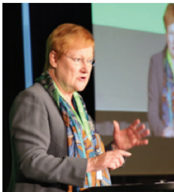
Tarja Halonen, Co-Chair, UN Secretary-General’s High-Level Panel on Global Sustainability