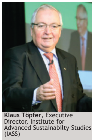
Klaus Töpfer, Executive Director, Institute for Advanced Sustainability Studies (IASS)