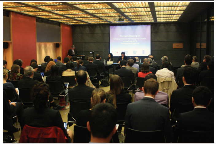
A view of the room during the event

In addition to the above, other processes that will feed into the post-2015 discussions include: the work of the UN General Assembly's Open Working Group (OWG) on Sustainable Development Goals (SDGs); regional consultations by the Regional Economic Commissions, which will result in a report on regional perspectives on the post-2015 development agenda; inputs from the Sustainable Development Solutions Network, set up by the UN Secretary-General in August 2012 to support global problem solving in ten critical areas of sustainable development; and input from businesses and the private sector through the UN Global Compact.