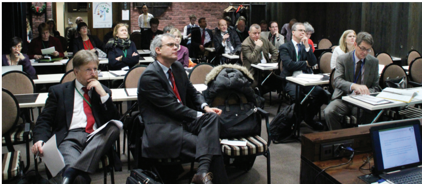
Delegates during Tuesday's discussions on the role of forests in ensuring food security