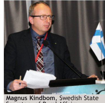
Magnus Kindbom, Swedish State Secretary of Rural Affairs

Magnus Kindbom, Swedish State Secretary of Rural Affairs, named tourism