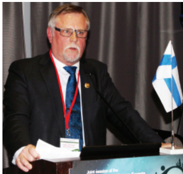
Esko Lotvonen, Mayor of the city of Rovaniemi

Esko Lotvonen, Mayor of the city of Rovaniemi, commemorated the fact that Arctic international cooperation started in Rovaniemi over two