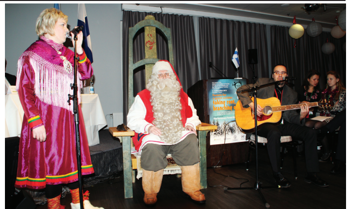
A band opened the session, singing traditional Sámi songs around Santa Claus.

session was to share a long-term vision for Europe’s future forests and sustainable forest management (SFM) for a green economy.