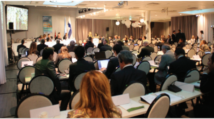
Delegates during Thursday's proceedings

past experience, the two bodies are encouraged to hold joint sessions every two years.” One delegate lamented this procedure, noting insufficient time to review the changes, and stressing that member states, rather than the Secretariats of the organizations, have the power to convene meetings. Supported by others, he expressed concern that the new wording would not be strong enough to ensure sufficient cooperation between the two bodies.