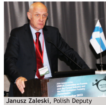
Janusz Zaleski, Polish Deputy Minister of Environment

Janusz Zaleski, Polish Deputy Minister of Environment, outlined various challenges relating to forest management today and in the future. He highlighted a Polish initiative to support small- and medium-size companies in exploring new forest markets that benefit the