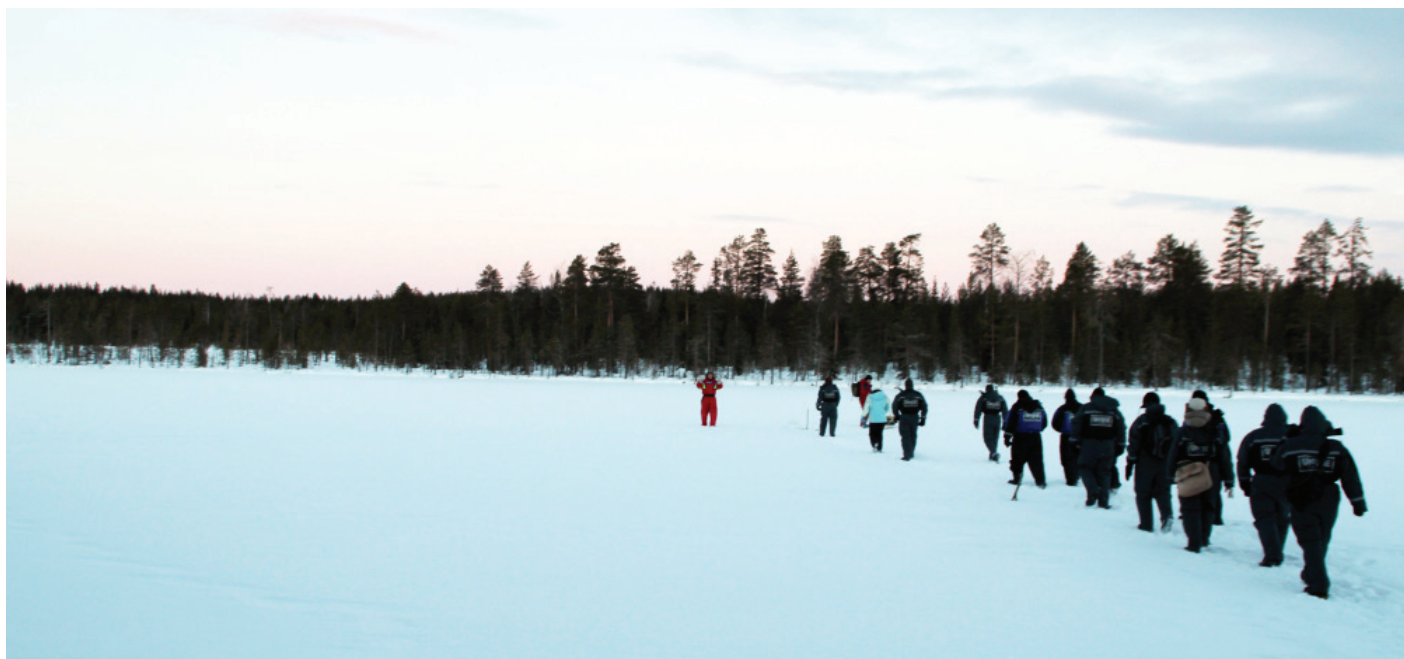
Accompanied by Santa Claus, delegates took part in a field trip hosted by Metsähallitus, the Finnish state-owned forestry enterprise. They visited a major logging site managed by Metsähallitus near the city of Rovaniemi, crossing the Arctic circle on the way.