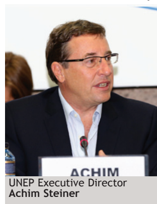
ACHIM UNEP Executive Director Achim Steiner