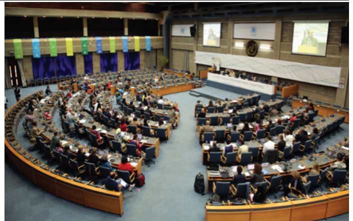
View of the opening session of the Global Major Groups and Stakeholders Forum (GMGSF-15)