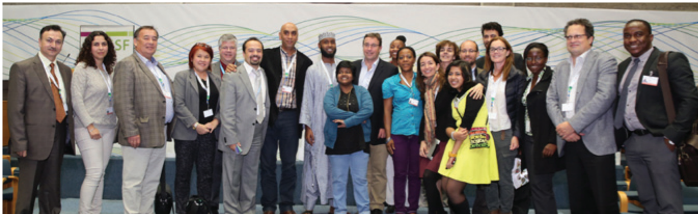
UNEP Executive Director Achim Steiner with GMGSF-15 participants

therefore bracketed in the current draft decision text; whether ways and means for civil society involvement will be further clarified; and the scope, nature and funding of UNEP LIVE and its relationship to the GEO-6 process.