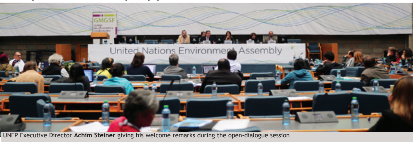
UNEP Executive Director Achim Steiner giving his welcome remarks during the open-dialogue session

During a final round of discussions touching on next steps in the UNEA process, among other institutional issues, a participant queried the relationship between UNEA-2 and Habitat-3, which will coincide. Another participant commented that effective participation of stakeholders would be contingent