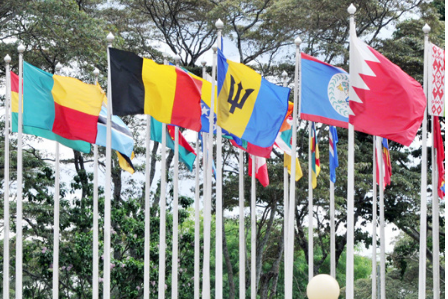
Country flags at UNEP headquarters

Seventh World Water Forum: This conference is organized on the theme of ‘Water for our Future.’ Sessions will discuss approaches to fundamental water challenges, drawing on national and regional perspectives, offering opportunities for political discussions, and showcasing technological solutions. dates: 12-17 April 2015 location: Daegu, Gyeongbuk, Republic of Korea contact: World Water Forum Secretariat phone: +82-2-3475-2652 email: secretariat@worldwaterforum7.org www: http://eng.worldwaterforum7.org/main/