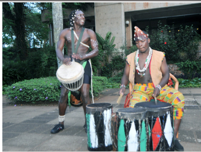
Local musicians entertained delegates during the evening reception.

Freshwater is a finite resource that is imperative for sustainable development, economic growth, political and social stability, human and ecosystem health, and poverty eradication. While water issues have long been on the international agenda, the debate on how to meet the growing global demand for freshwater has intensified in recent years, as the deadline for