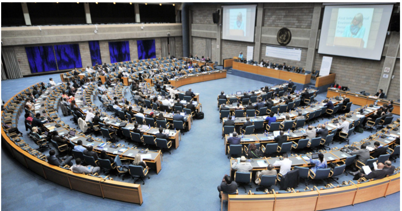
A bird's eye view of the room during the opening of the technical segment

RAMSAR CONVENTION: The Convention on Wetlands of International Importance (the Ramsar Convention) was signed in Ramsar, Iran, on 2 February 1971, and entered into force on 21 December 1975. The Convention provides a framework for national action and international cooperation for the conservation and wise use of wetlands and their resources.