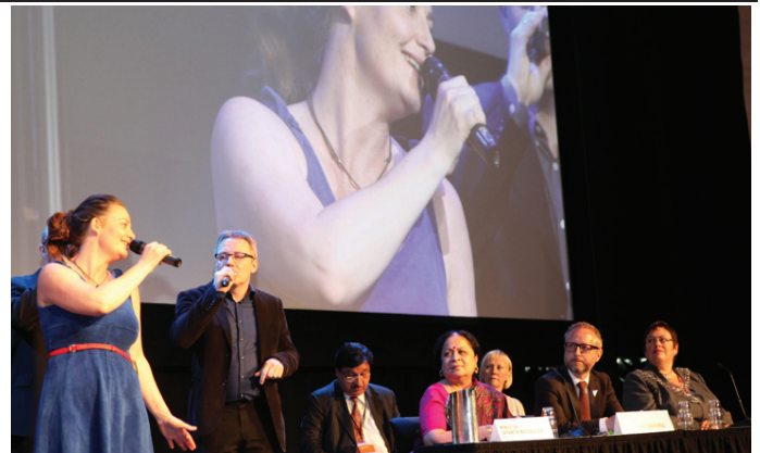
"Apes & Babes," a Norwegian acapella group performing during the opening session of the 7th Trondheim Conference on Biodiversity.

The first Trondheim Conference, held in May 1993, provided scientific input to the first meeting of the Intergovernmental Committee of signatories to the CBD. The