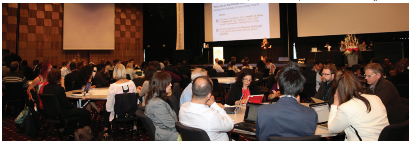
Roundtable discussions on the Aichi Targets 3 and 4

On forest management, participants highlighted: systemic collaborative management, with a focus on the whole landscape and the market process; strategic combinations of incentives; fight against invasive alien species; market-based tools such as valuation of ecosystem services; certification; land-use practices that benefit biodiversity; and conservation and restoration as a tool for protecting the most valuable forest areas. They recommended, inter alia : transforming incentives