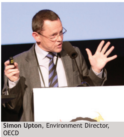
Simon Upton, Environment Director, OECD

Simon Upton, Environment Director, Organisation for Economic Co-operation and Development (OECD), presented on bridging economic and ecological policies for a sustainable society, including relevant work on biodiversity under the Environmental Outlook to 2050. He identified four priorities for action: reforming or removing harmful environmentally subsidies; scaling up private sector engagement; improving data, metrics and indicators; and mainstreaming and integrating biodiversity into other policy areas and sectors of the economy. He presented examples of subsidies that actively support unsustainable environmental