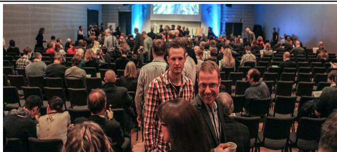
Participants fill the room for the opening plenary

The Arctic Council is comprised of the eight Arctic states (the Russian Federation, Canada, the US, Denmark (including Greenland and the Faroe Islands), Norway, Sweden, Finland and Iceland) and six organizations with permanent participant status, representing the indigenous peoples of the Arctic: the Inuit Circumpolar Council, Saami Council, Aleut International Association, Russian Association of Indigenous Peoples of the North (RAIPON), Arctic Athabaskan Council and Gwich'in