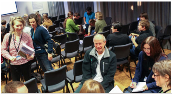
Participant discussions during the session on a "horizon scan of the management of Eurasian reindeer."