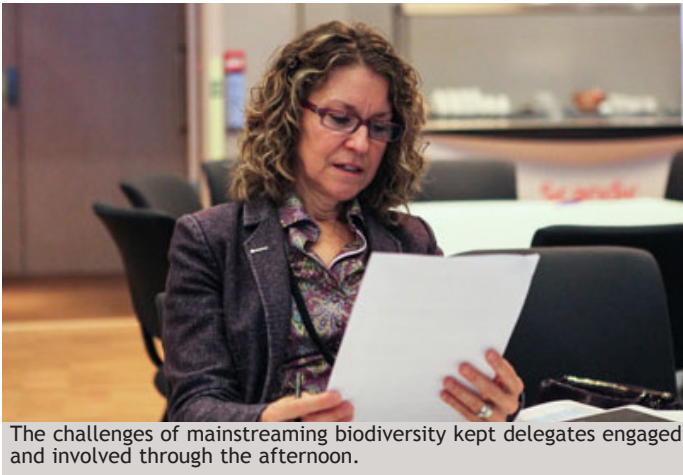
The challenges of mainstreaming biodiversity kept delegates engaged and involved through the afternoon.

highlighted that topography may attenuate the effect of changes in vegetation cover and that more data is needed to assess the initial conditions and responses of the system.