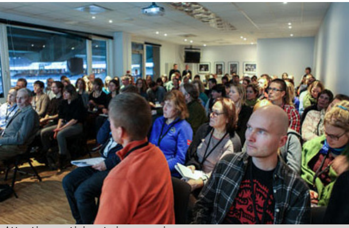
Attentive participants in a session