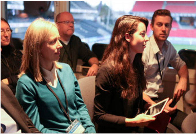
Participants listening to a presentation

implementing appropriate spatial and temporal measures to reduce disturbance to significant areas; and improving oil spill response coordination.