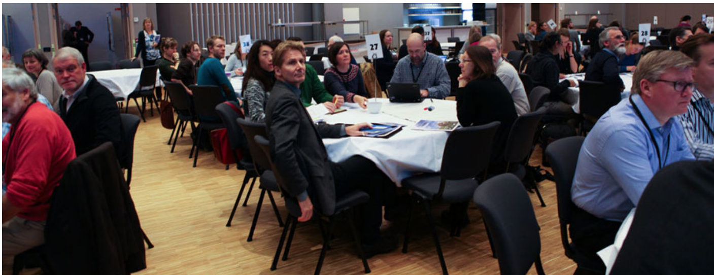
Participants filled the room for a plenary talk and roundtable discussions

suggested: increased efforts to demonstrate why biodiversity is important for people, including through outreach and education; more funding for biodiversity research; linking biodiversity to other scientific issues, and extending it to a landscape scale; and avoiding the misuse and misrepresentation of scientific results.