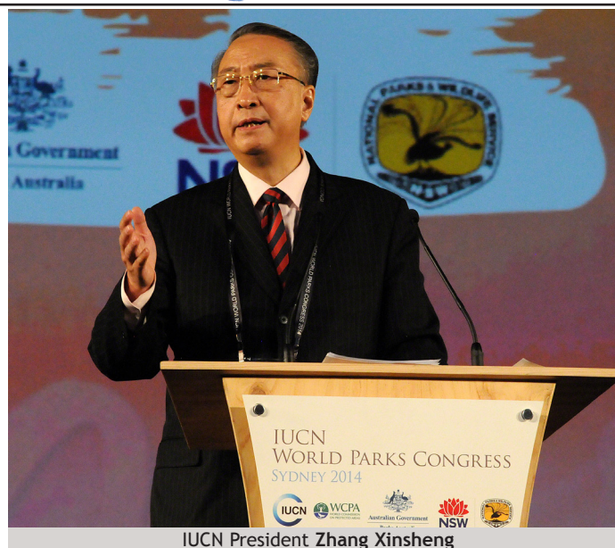
IUCN President Zhang Xincheng

FIRST WORLD CONFERENCE ON NATIONAL PARKS: The first World Conference on National Parks (Seattle, US, 30 June to 7 July 1962) aimed to establish a more effective international understanding of national parks and