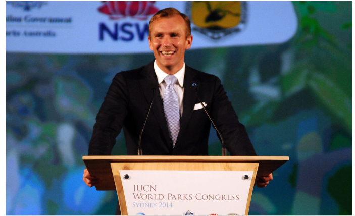
Rob Stokes, New South Wales Minister for the Environment and Minister for Heritage