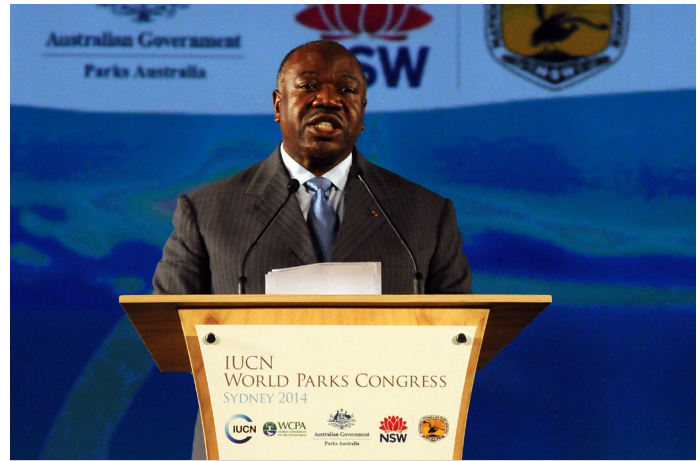
President Ali Bongo Ondimba, Gabon