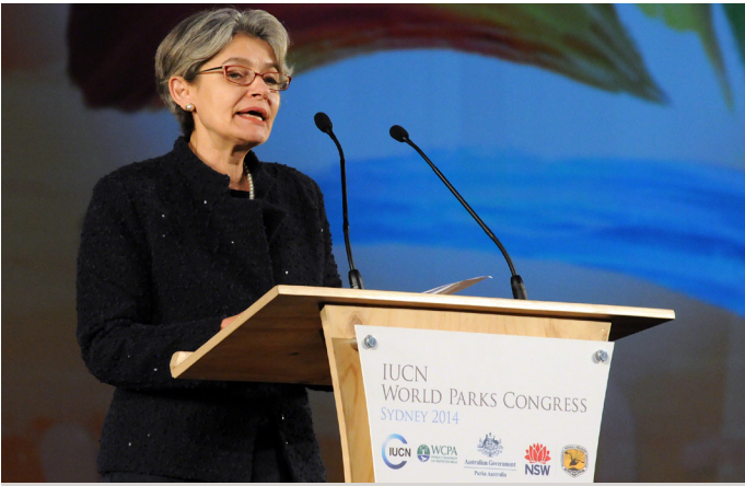
Irina Bokova, Director-General of the UN Educational, Scientific and Cultural Organization (UNESCO)