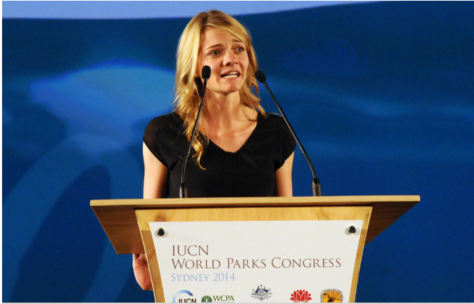
Jessica Watson, the youngest person ever to sail solo and unassisted around the world