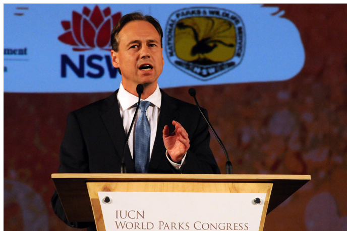
Greg Hunt, Australian Minister for the Environment

over the decade 1992-2002 and provided a global framework for collective action. The Plan aimed to extend the PA network to cover at least 10% of each major biome by 2000.