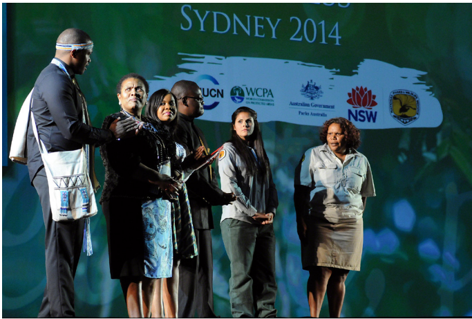
Patrons and champions of the WPC 2014

Protected Areas. The main objectives of the Congress included: positioning PAs, subsystems and complementary conservation strategies as territories for life and peace, in light of the new economic and social development challenges of Colombia; assessing social and environmental dynamics in urban and rural landscapes, and developing complementary strategies to address these challenges for PA management; and creating opportunities for cultural exchange, knowledge sharing and social valuation of PAs in Colombia.